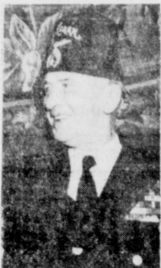
JOINS MYSTIC SHRINE—Fleet Admiral Ernest J. King smiles after becoming a member of the Ancient Order of Nobles of the Mystic Shrine in Cleveland, O.