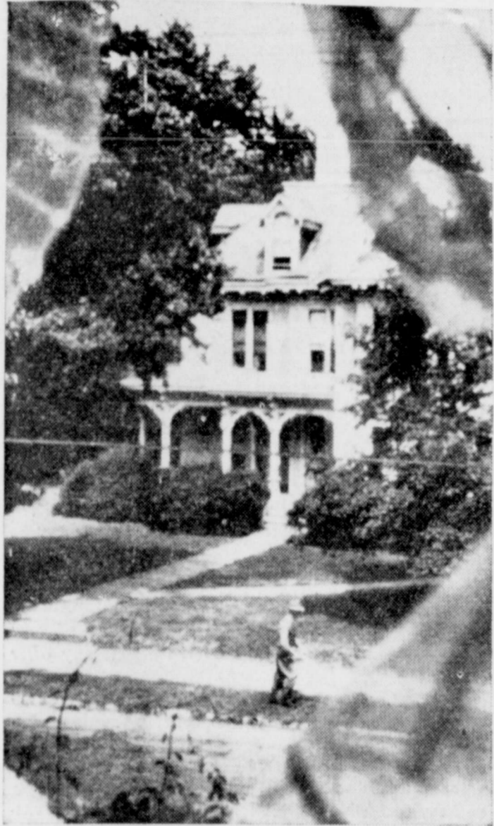
SUMMER WHITE HOUSE —This peaceful view of the "Summer White House" in Independence, Mo., taken from a curtained room across the street, provides a sharp contrast to the hustle and bustle that typifies President Truman's home in Washington, D.C. The President's daughter, Margaret and her grandmother, are spending the summer here.