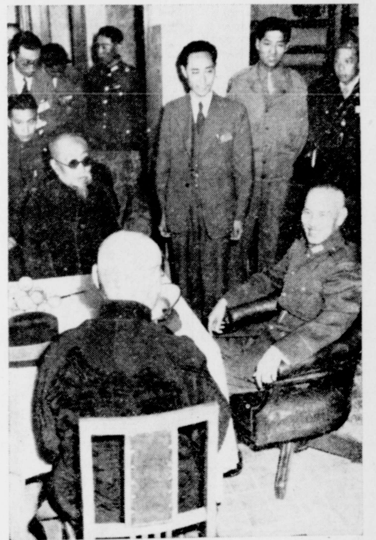
OLD AND NEW CHINA—Generalissimo Chiang Kai-shek, seated at head of table, talks with the graybeards of "old" China and young officials of the "new," following arrival at the Changchun airport for his first tour of strife-torn Manchuria.

Caribou on the North American continent at the present time are estimated to number about fifty million.