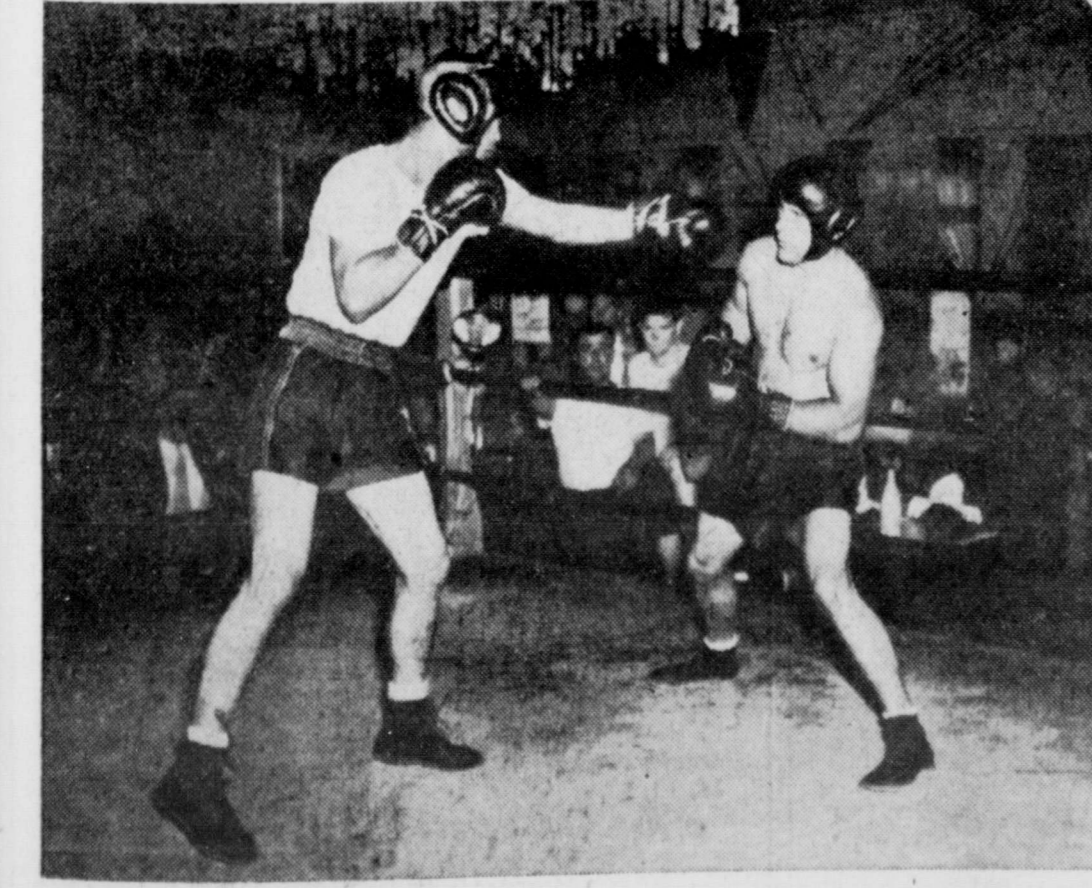
SIDESTEPS A LEFT —Billy Conn, heavyweight contender who will fight champion Joe Louis at Yankee Stadium, New York City, on June 19, sidesteps a left jab thrown by a sparring partner during training session at Greenwood Lake, N.J.