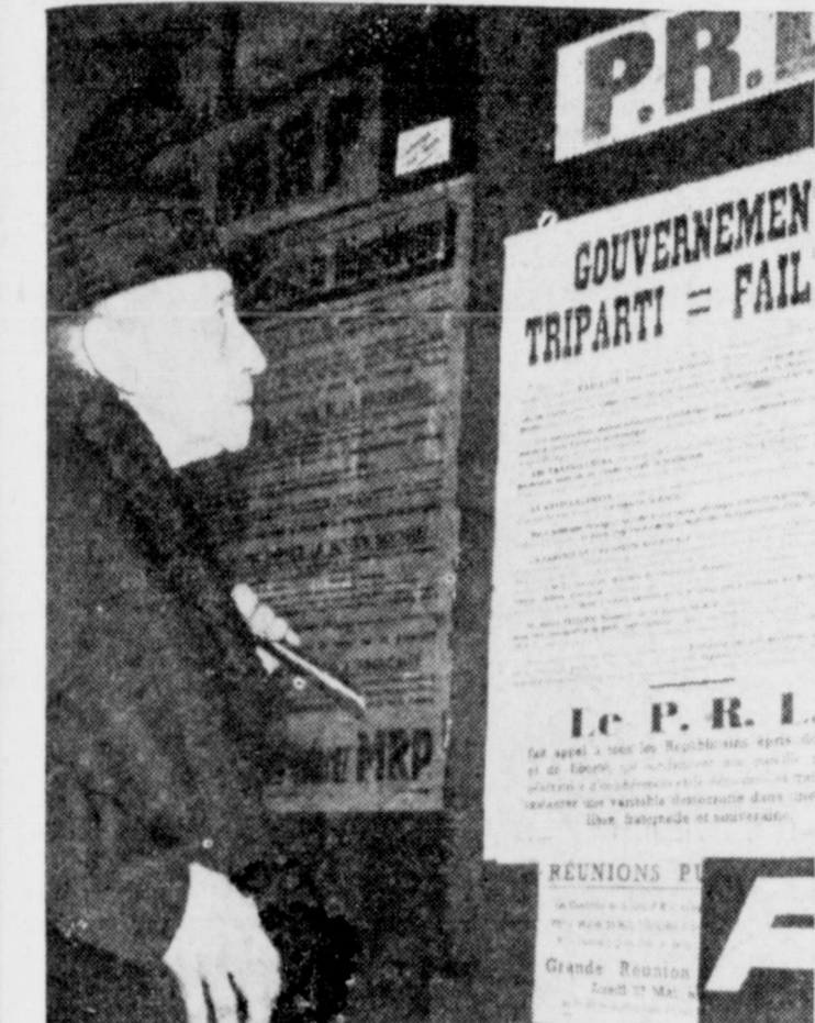
A NEW VOTER LOOKS AT ELECTION RESULTS—An old French woman stands in the rain to read election results posted in a Paris street. The vote of the newly-enfranchised women is believed to be an important factor in the MRP victory.