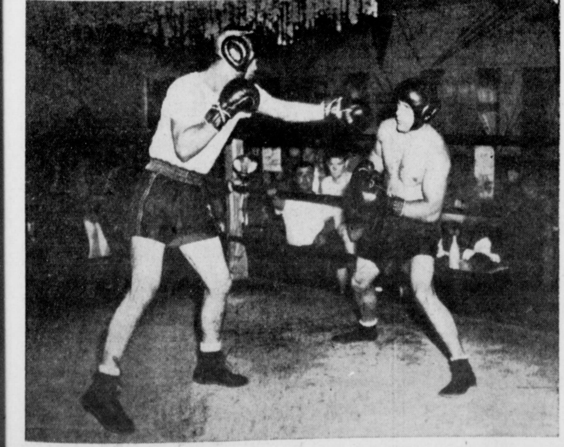
SIDESTEPS A LEFT—Billy Conn, heavyweight contender who will fight champion Joe Louis at Yankee Stadium, New York City, on June 19, sidesteps a left jab thrown by a sparring partner during training session at Greenwood Lake, N.J.