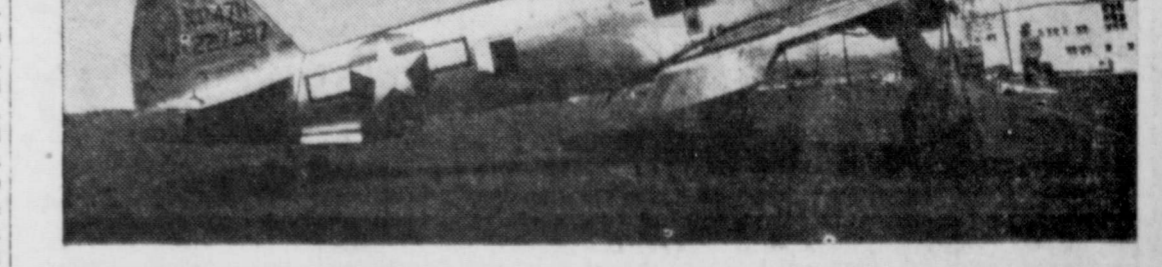
FOR GREATER PILOT SAFETY—Pilots need no longer fear being trapped in a disabled plane. The Army's latest safety device will catapult a flyer clear and automatically open his parachute. Demonstrated at Wright Field, Dayton, O., the device throws dummy 80 feet in air.

FOR GREATER PILOT SAFETY. Pilots need no longer fear being trapped in a disabled plane. The Army's latest safety device will catapult a flyer clear and automatically open his parachute. Demonstrated at Wright Field, Dayton, O., the device throws dummy 80 feet in air.