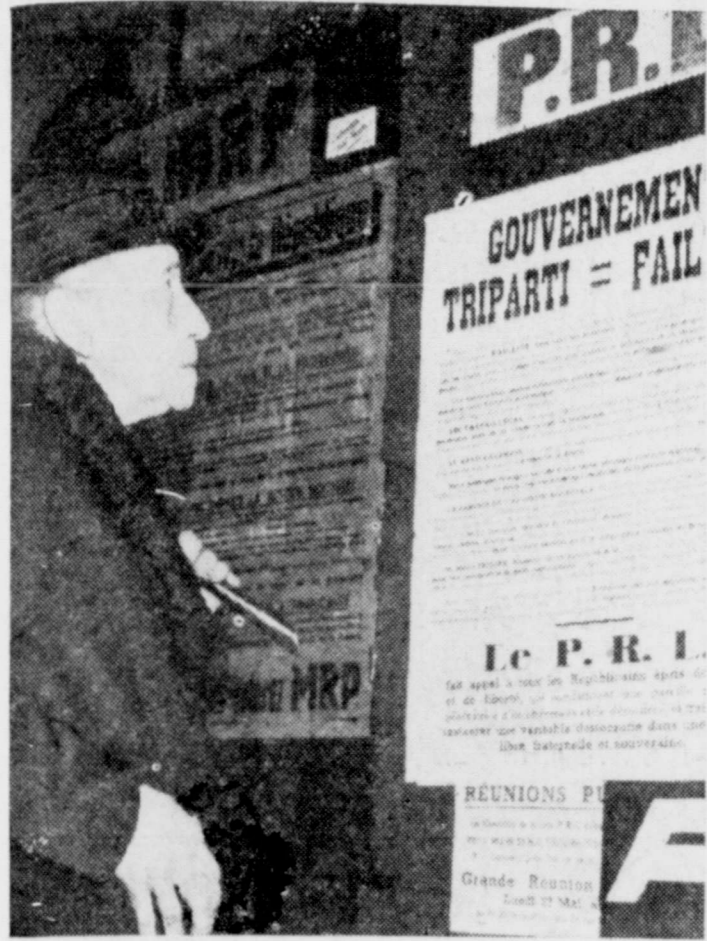
A NEW VOTER LOOKS AT ELECTION RESULTS —An old French woman stands in the rain to read election results posted in a Par's street. The vote of the newly-enfranchised women is believed to be an important factor in the MRP victory.