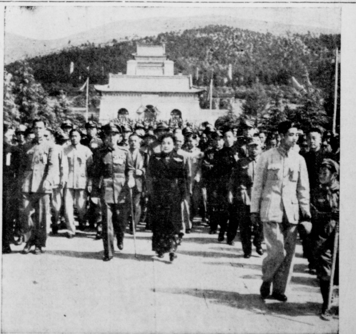
VISIT FOUNDER'S TOMB—Generalissimo and Madame Chiang Kai-shek celebrate the return of the Nationalist Government to Nanking. They are shown leaving the tomb of Sun Yat-sen, background, founder of the Chinese Republic, after ceremony.