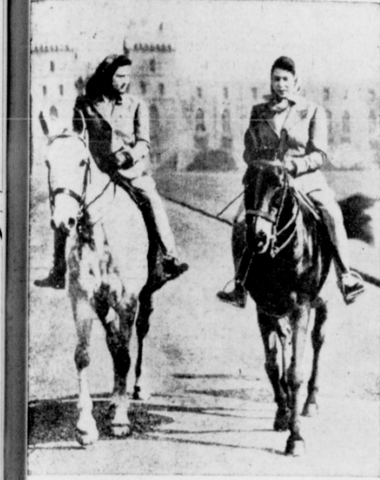
ROYAL SISTERS—Princess Elizabeth, right, and her younger sister, Princess Margaret Rose, 15, leave Windsor Castle for a center around the grounds. Next in line for English throne, Princess Elizabeth recently celebrated her 20th birthday.