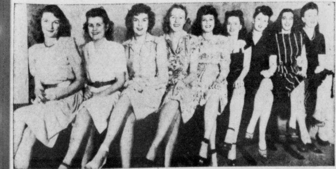
COMPETE FOR BEAUTY TITLE IN JAPAN—Nine U. S. Government workers in Tokyo are contestants in the "Miss Stateside" beauty contest now being held there. Girls, from all parts of U. S., are working with occupation forces.

HOW TIMES CHANGE! NEW YORK, May 24.—On May 24, 1830 — 116 years ago — passengers rode the first railroad built in the United States for general transportation purposes. The line, built by the Baltimore and Ohio railroad, was opened between Baltimore and Ellicott's Mills, Md. But — passenger's needed a horse on that day, too. The first train was horse-drawn.