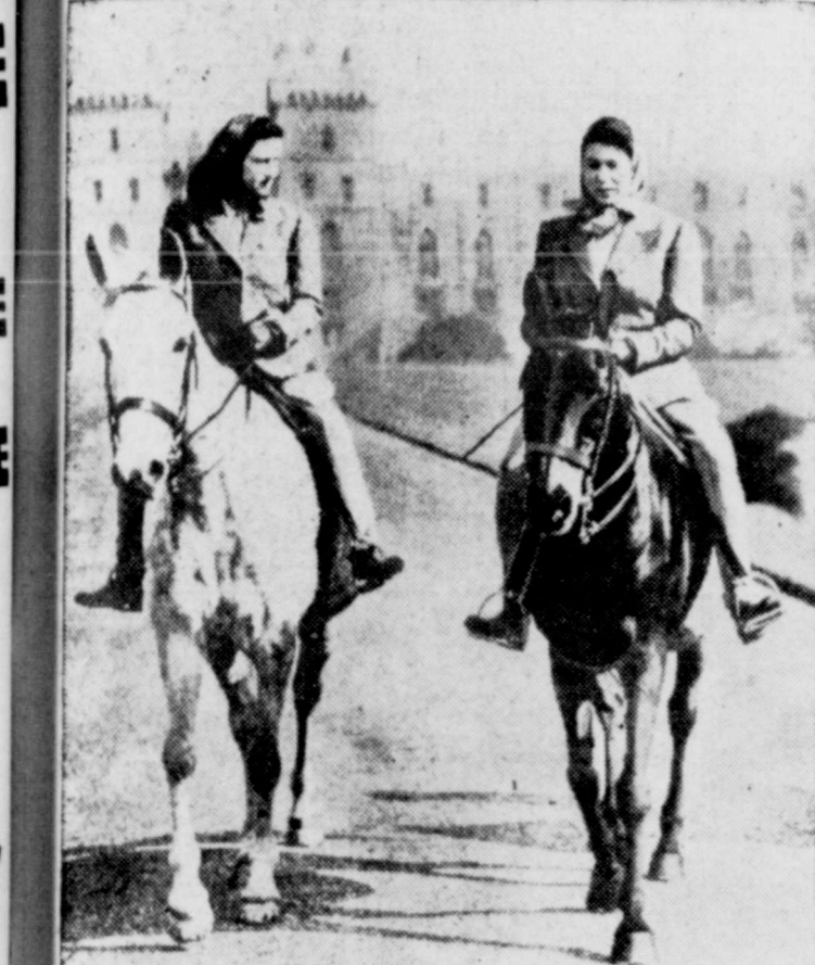
ROYAL SISTERS—Princess Elizabeth, right, and her younger sister, Princess Margaret Rose, 15, leave Windsor Castle for a canter around the grounds. Next in line for English throne, Princess Elizabeth recently celebrated her 20th birthday.