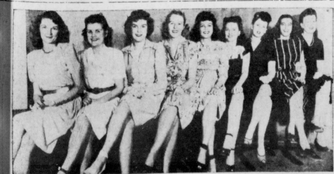
COMPETE FOR BEAUTY TITLE IN JAPAN—Nine U. S. Government workers in Tokyo are contestants in the "Miss Stateside" beauty contest now being held there. Girls, from all parts of U. S., are working with occupation forces.

Special committees will be organized to assist in various phases of the campaign, with particular