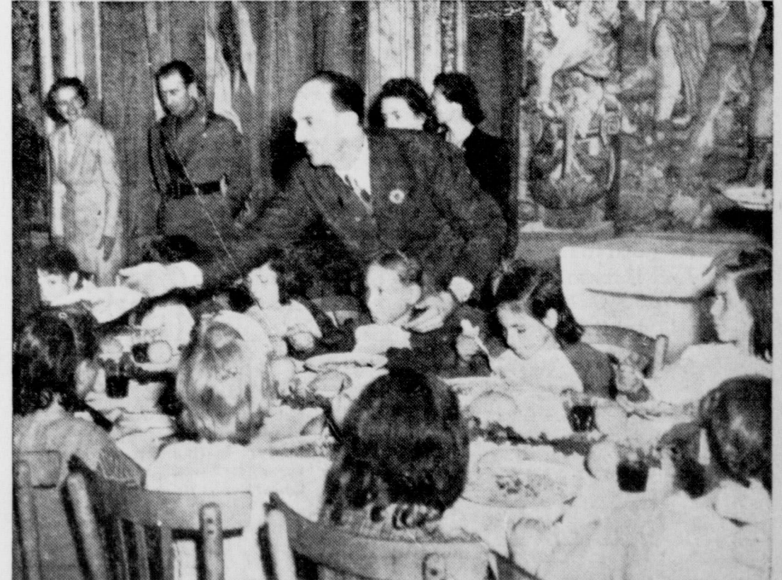
THE PRINCE AND THE CHILDREN—Crown Prince Umberto, Lieutenant General of the Realm, helps feed part of 600 poor children of Rome who dined at the Royal Palace on Easter. The Italian Royal family has made the feast of the poor an annual event.