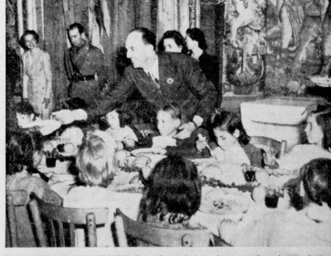
THE PRINCE AND THE CHILDREN—Crown Prince Umberto, Lieutenant General of the Realm, helps feed part of 600 poor children of Rome who dined at the Royal Palace on Easter. The Italian Royal family has made the feast of the poor an annual event.