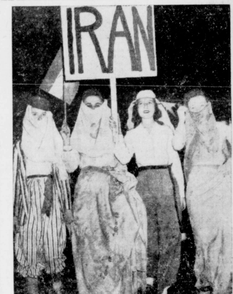
COLLEGIAN U. N. CONFERENCE—Northwestern University co-eds parade at Evanston, Ill., in the native costumes of the nations they represent at a five-day simulated U.N. conference.

WASHINGTON, April 30. (UP)—Two cotton textile officials today asked congress to abolish price controls on cotton and drew a rebuke from senate Democratic leader Alben W. Barkley, Ky. They testified before the senate Banking committee which is considering legislation to extend price controls beyond the June 30 expiration date. Barkley interrupted to say—"You want controls off cotton. The meat people want controls off meat. The wool men want controls off wool. If the congress tries to grant all these requests we might as well repeal the act outright."