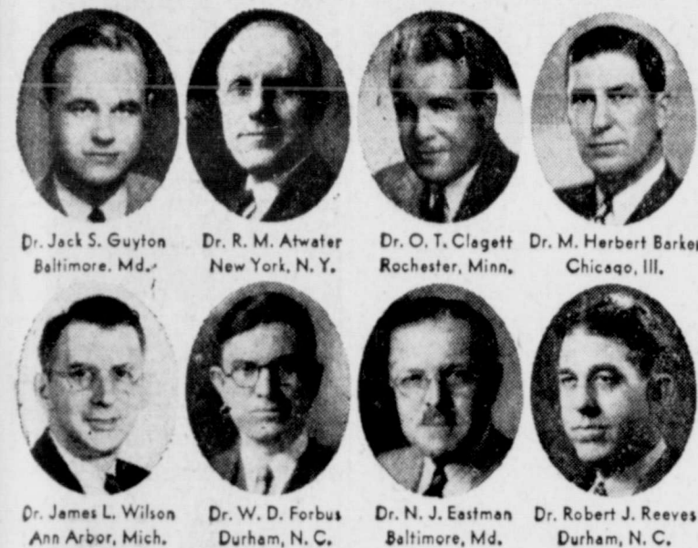
Some of the leading medical authorities of the United States will attend the 79th annual session of the State Medical Association of Texas at Galveston May 6-9. They will discuss, for the benefit of Texas doctors, subjects of medical science in which they have won eminence. The eight distinguished guests represent such centers of medical learning as Johns Hopkins, Duke University, Mayo Clinic and University of Michigan.