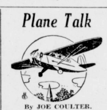
By JOE COULTER.

LEONARDO, N. J., April 20. (UP)—A three-inch shell exploded in a sailor's arms here today and touched off a series of blasts which ripped the Destroyer-Escort USS. Solar into a twisted hulk. The navy said officially that seven men were missing and probably dead, more than 14 others were in hospitals.