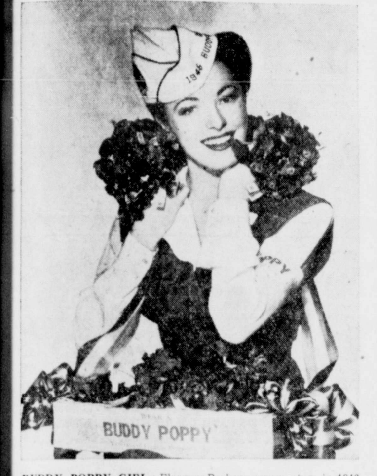
BUDDY POPPY GIRL-Eleanor Parker, screen star, is 1946 onal Buddy Poppy Girl. Selection, announced in New York ty, was made by Veterans of Foreign Wars. Poppy Day sale be held throughout nation during Memorial Day week.