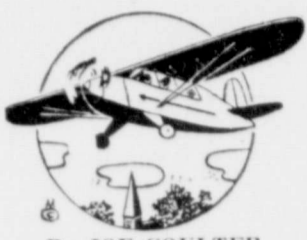
By JOE COULTER.