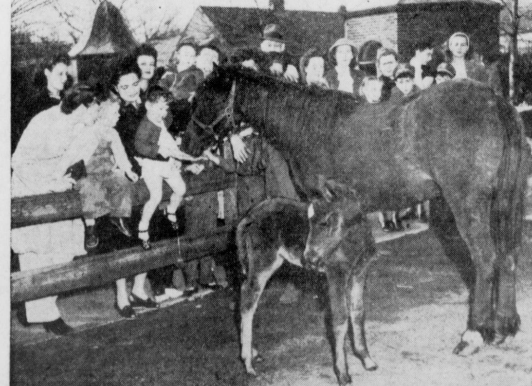
SHOWING OFF—"Bess," proud mother, exhibits her spindly-legged 13-day-old colt, "Little Bess," to visitors at Central Park Zoo in New York City. "Little Bess" doesn't mind being in the public eye and takes the attention of her audience very calmly.