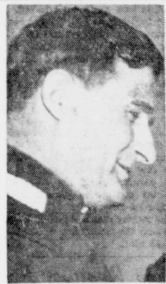
GEN. SOKOLOVSKY, first deputy to Marshal Georgi K. Zhukov, may soon succeed his chief as Soviet boss of Russian Occupation Zone in Germany.

WILLOW RUN — From bombers to farm machinery. First Graham Paige Rototiller farm machines roll down long assembly line at Willow Run, Mich., Kaiser-Frazer Company plant over the vast aircraft plant when its war work ended.