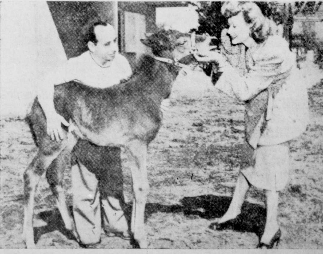
HOPE HE'S A WINNER—Lucille Ball, takes a good look at "Lucille Ball" while jockey Johnny Longden holds the two-week-old filly named for the screen actress. Longden has high hope that his little charge will be a future stakes horse.