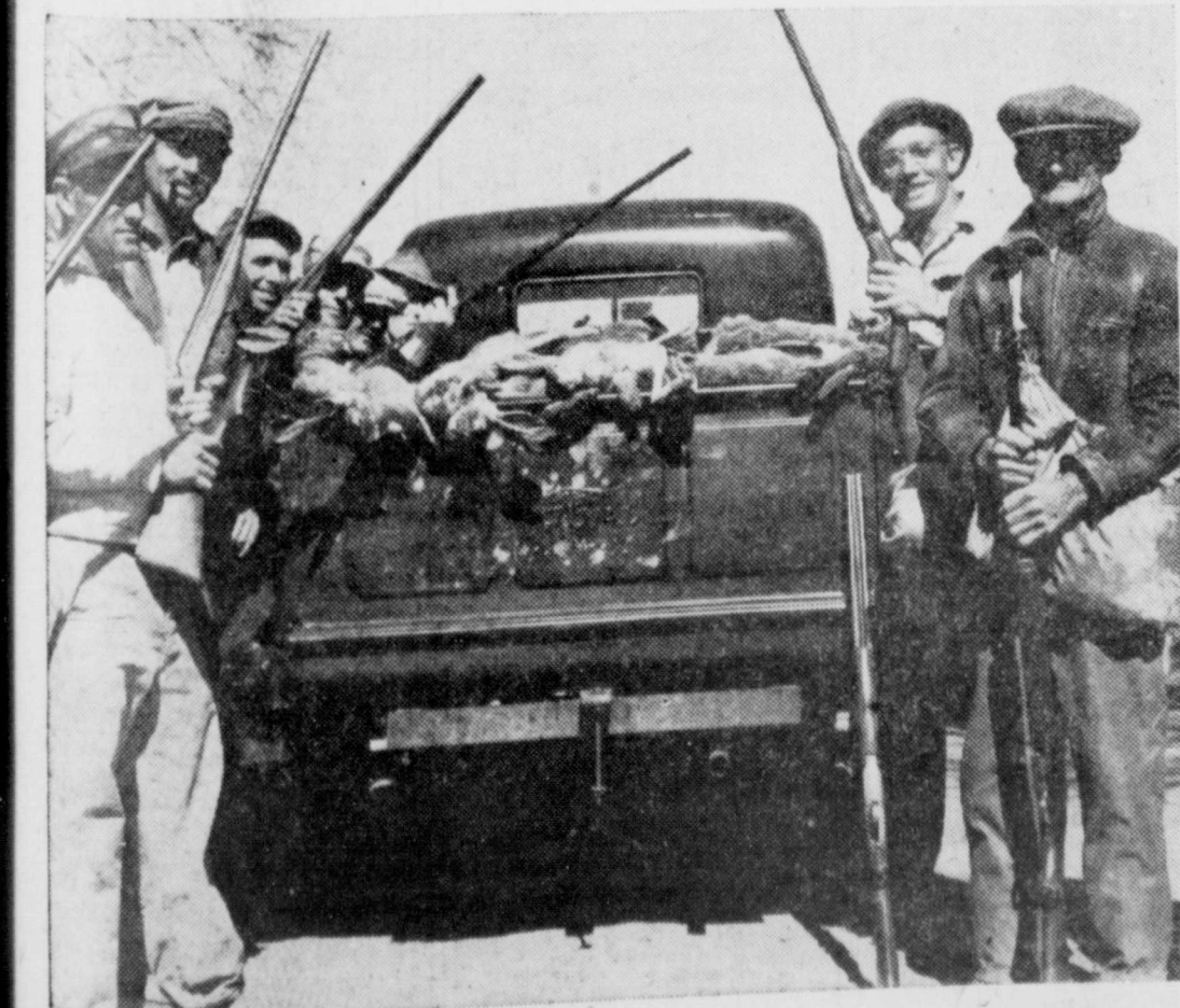
THESE RABBITS' FEET WEREN'T LUCKY—This is first truck load of an estimated 3000 hares bagged in a drive by California hunters. More than 500 sportsmen from Los Angeles to Marysville, Calif., answered the call to help rid Maricopa County of its weasly jack rabbits.

BONHAM, Mar. 14. — Bonham will vote April 2 on a proposed change in city government from a mayor-council form to a council-manager type.