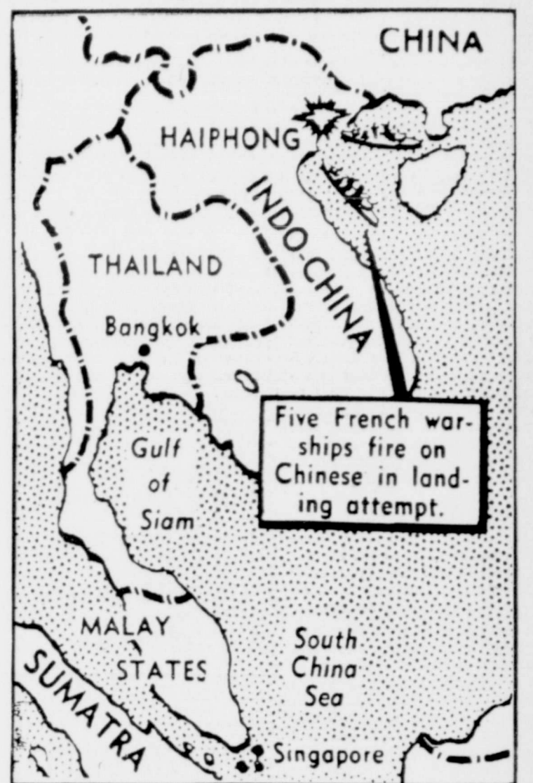
TROUBLE IN INDO-CHINA—Five French warships are reported to have fired on a Chinese garrison here. "Technical difficulties" which arose during the transfer of Haiphong from Chinese to French control apparently caused the incident. Chinese claim the French attempted to land under the force of arms. French sources say the first firing was done by unidentified shore batteries.