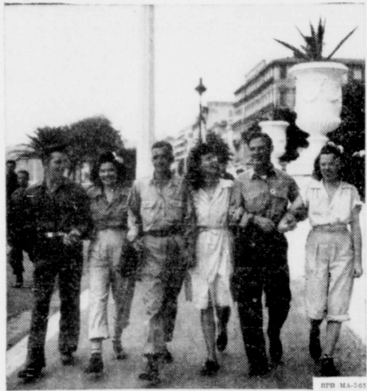
This happy group is enjoying a stroll on the French Riviera. Nice is famous for its relaxing atmosphere, and these "Guardians of Victory" are taking full advantage of a furlough in the "Carnival City." Story-book scenes such as this are enjoyed by men who join the Regular Army. Qualified civilians must be 17 to 34 years of age, inclusive.