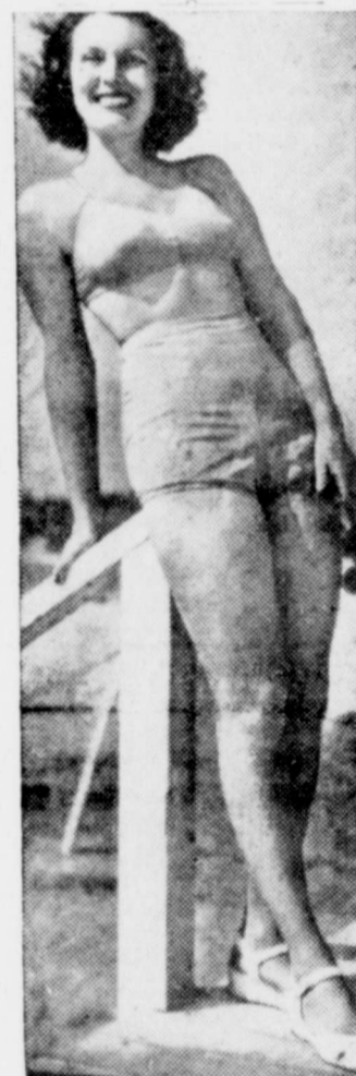
RELAXED —Brenda Joyce, lovely Universal Pictures starlet, relaxes after a busy day at the studios. The photographer who took this picture forgot to mention whether or not this is Brenda's regular working costume.