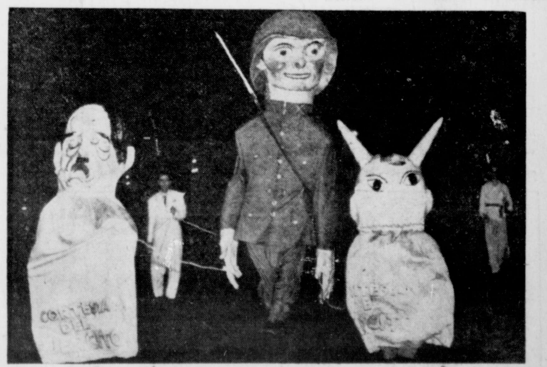
HAVANA MAKES MERRY—Members of Cuba's Army designed these grotesque figures of Hitler and Hirohito for the opening of Havana's Carnival season. The parade, which ambled down the Prado, boasted 19 jonga lines and African Bongos as well as dozens of these giant dolls. It was Havana's first real blowout in six years.

President Truman has asked Congress for a law placing the speaker of the House second in line for the presidency.