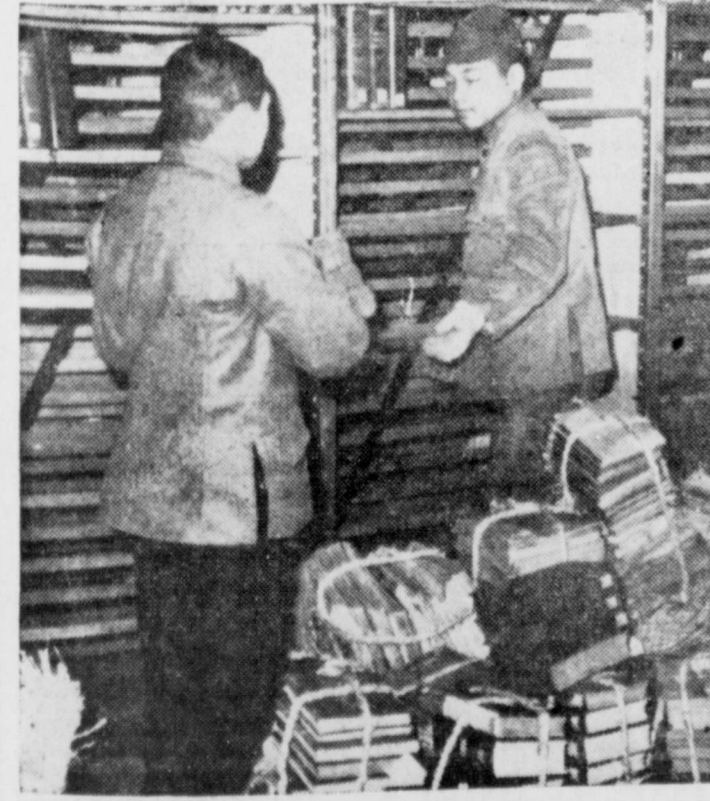
JAPANESE BOOKS RETURNED TO CITIES—Japanese sort and stack books in the Ueno Imperial Library in Tokyo after they were brought back from small towns where they had been kept safely during the war. Several million books are kept at the library. Most sought after are books on science and literature. Readers show little interest in current social and political events.