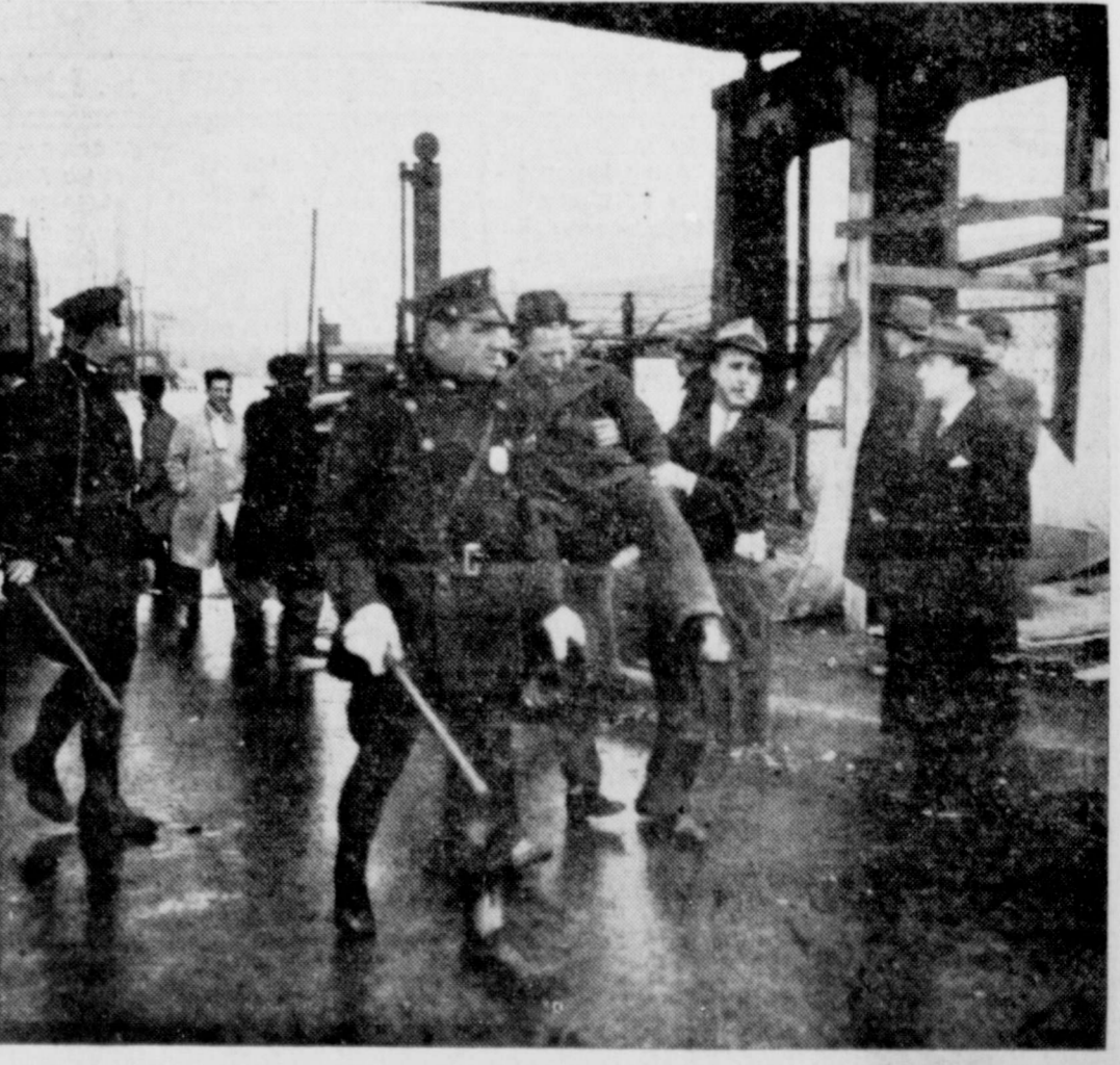
MASS PICKETING DESPITE INJUNCTION—An injured picket at the Western Electric Company Plant 1 in Kearney, N. J., is carried away from gate. Despite the issuance of an injunction limiting picketing to 15 strikers at each gate, mass picketing went on. A total of 1500 pickets kept 3400 non-production workers from entering the plant, violating the stay law.