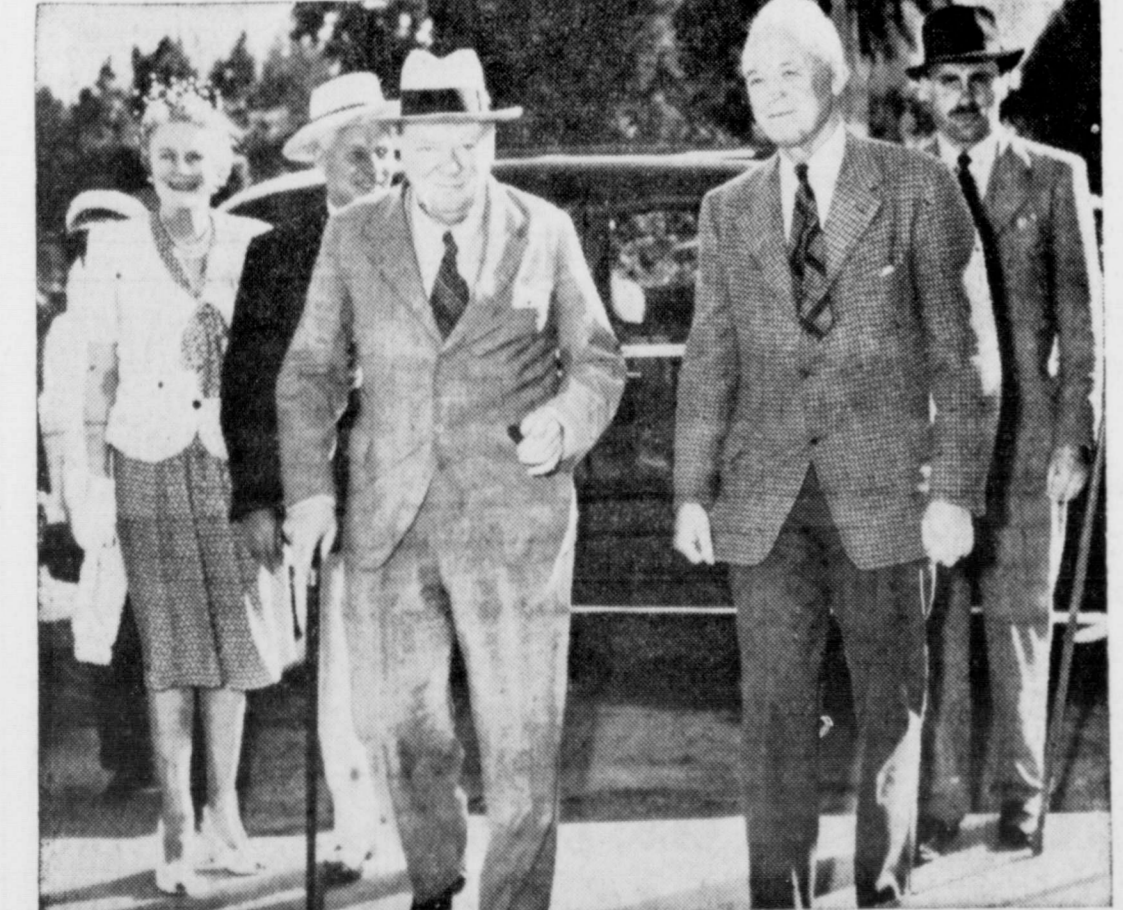
DAY AT THE RACES—With cane and cigar, former British Prime Minister Winston Churchill arrives at Hialeah Park, Fla., with Gen. of the Army Henry H. Arnold, right, in mufti. Mrs. Churchill is at left. Gen. with mustache behind General Arnold is from Scotland Yard.

WASHINGTON, Feb. 9. — Stories reaching congressional leaders of misconduct in Germany cause increasing concern. Some now believe investigation can't be avoided. Returning officers and GI's tell of widespread practice of intimacy with German women, putting them on government payroll as interpreters, feeding them Army rations. Other stories, told too often to be ignored, concern speculation in currencies, petty but considerable looting. When stories first started coming in, some congressmen hoped situation was temporary.