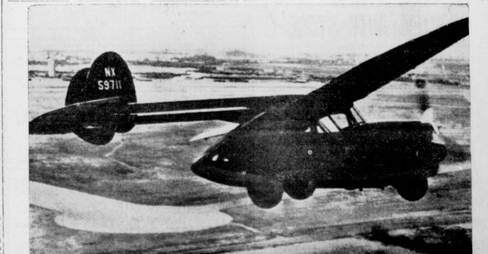
FLYING AUTOMOBILE—With the wings and tail structure removed, the Rodable, an experimental automobile-type airplane, developed by Southern Aircraft Division, Portable Products, Inc., is ready for highway use.

CAIRO, Feb. 9. — Egyptian students battled Cairo police Saturday during a demonstration against Britain's attitude toward revision of the British-Egyptian treaty. At least 50 students and 30 policemen were injured, and approximately 150 students were arrested before quiet was restored.