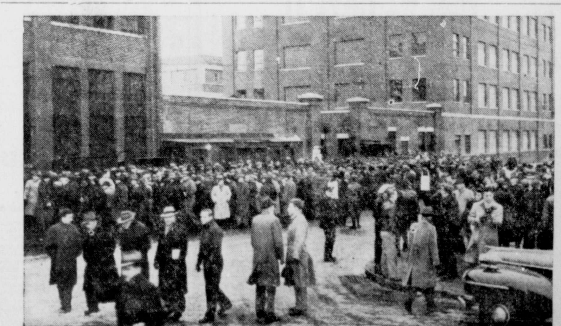
PICKETS HOLD THE LINE AGAINST OFFICE HELP at the Harrison, N.J., Worthington Pump and Machinery Works. Non-union workers, reporting for work were barred from the plant by 500 United Steelworkers, CIO. The barred office workers are shown as they wait in the cold before the plant. Officials of the plant told them to go home.

HOUSTON, Jan. 30. - About fineries of the Humble Oil and Re-