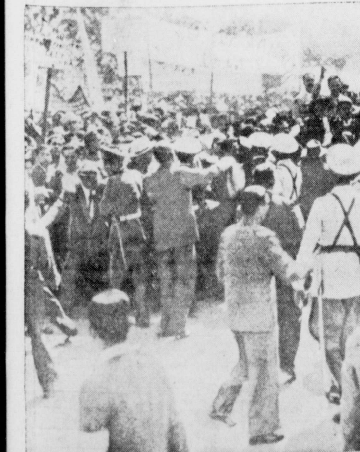
PERON CAMPAIGNS—Car carrying Col. Juan Peron has tough going through the crowd that turns out to welcome him in Buenos Aires during his campaign for the presidency of Argentina.