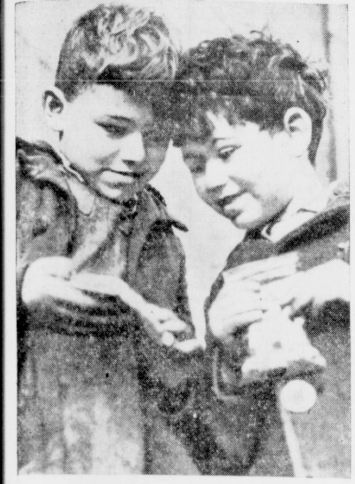
SWEET TREAT—Candy from American Junior Red Cross brings real joy to these children of La Courneuve, France. Organization has sent 250,000 packages of candy-coated chocolates to children in Europe and the Philippines.

WILL TRADE — 1936 Chevrolet pickup for a passenger car. See Mrs. Reynolds at Cisco Transfer Co. 101 FOR SALE — Complete 1936 Ford motor; also transmission and differential. J. C. Coats, route one, Cisco. 101