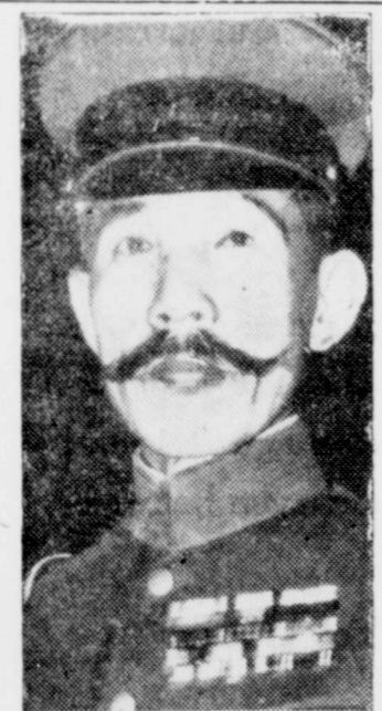
ARRESTED —Former Japanese War Minister, Baron General Sadao Araki, was arrested in Japan and charged with being a war criminal, according to an announcement from Gen. Douglas MacArthur's headquarters.