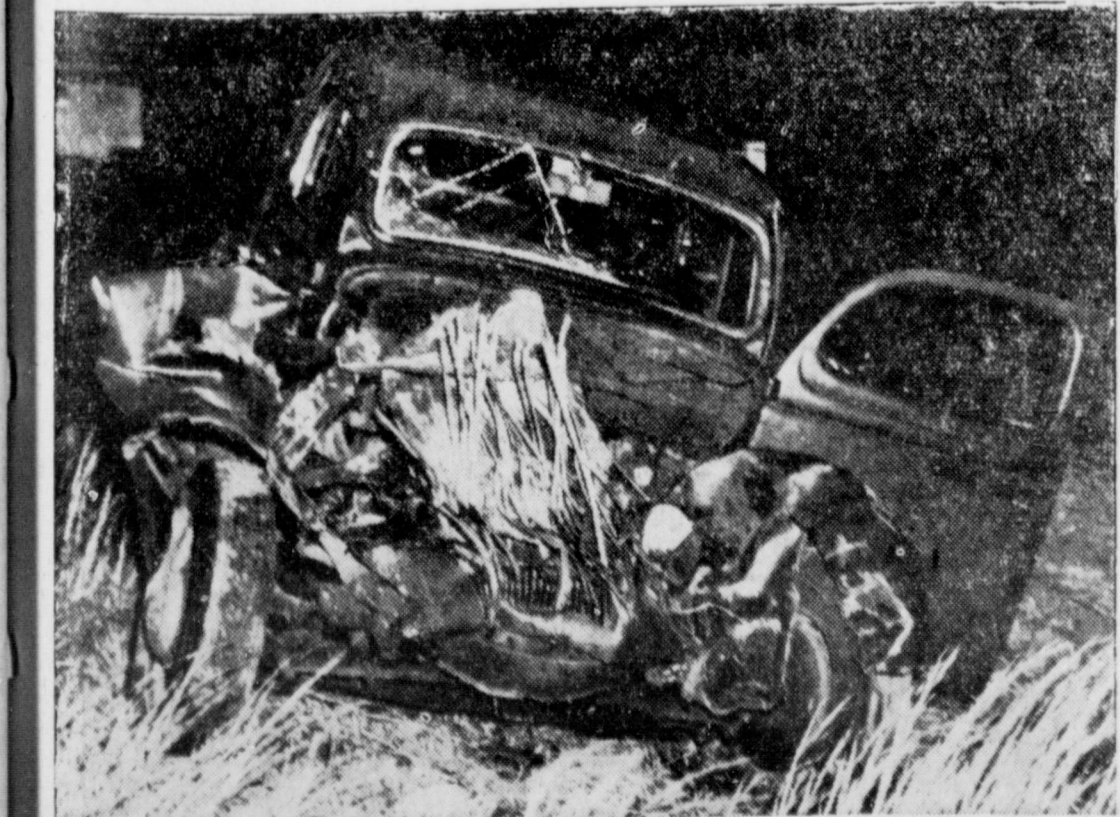
ACCORDION MODEL —Though this car folded up like an accordion after being hit by a truck at Uniondale, L. I., the driver, Robert Pfeiffe of Babylon, L. I., was unhurt. Car spun out of control when engine froze and spun around in road. When Pfeiffe went to get help, a truck smashed car.

For the week, additional cases brought the total to 11,510 compared with 10,660 a week earlier. Cameron county in the lower Rio Grande valley with 770 cases led.