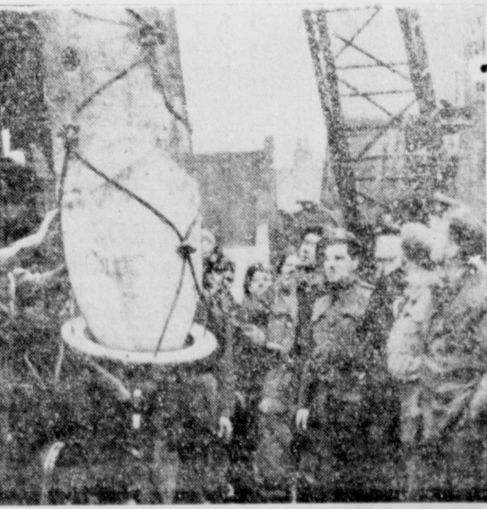
CROYDEN BOMB REMOVED —British soldiers gape at "Hermann", German-dropped bomb, as it hangs from crane after being taken from the ground in which it was embedded in Croyden, England. Families in neighborhood were evacuated during operation.

ABILENE, Jan. 11. — Two persons were dead and 18 others injured, none critically, as a result