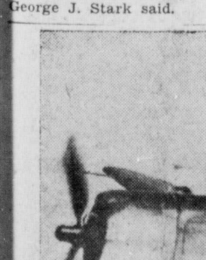
SEA WOLF ALOFT-First picture released of Navy's Chance Vought XTBU-1 Sea Wolf, a torpedo bomber with a top speed of more than 300 m.p.h. Plane, powered with Pratt & Whitney engine, was produced at Allentown, Pa It never saw combat.