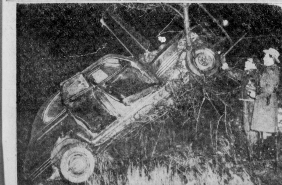
UP A TREE—State police marvel at freak accident which ended with this car up in a tree. Driver missed a curve on Northern State Parkway at Jericho Turnpike, Old Westbury, L. I.