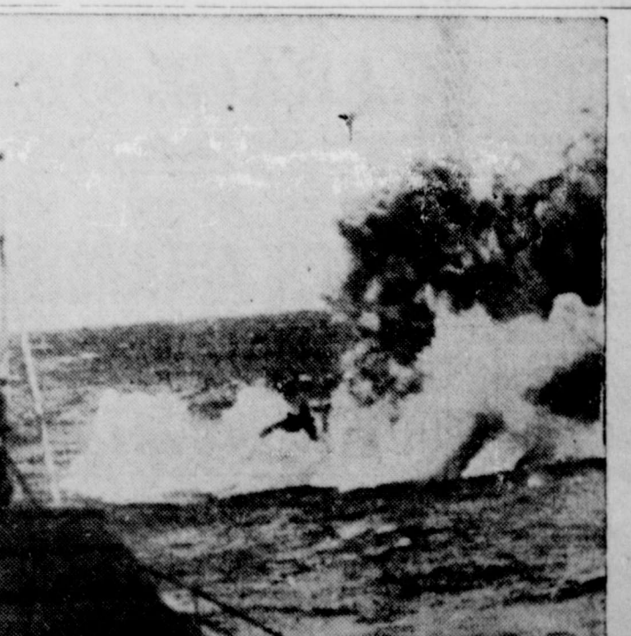
DEATH OF THE NAZI WOLFPACK—What's left of the German Navy has been marked for disposal by sinking off the coast of Ireland. A hundred German U-boats, which formerly prowled Atlantic waters to prey on Allied shipping, are being sent to the bottom. This submarine, left, with explosive charges attached to her hull, has been towed to the graveyard and is ready for the kill. Explosion sends geysers of water hundreds of feet into the air. Bits of the shattered sub are strewn over a wide area as the U 2361 is sunk. Other Nazi naval units are destined to meet their end by gunfire.