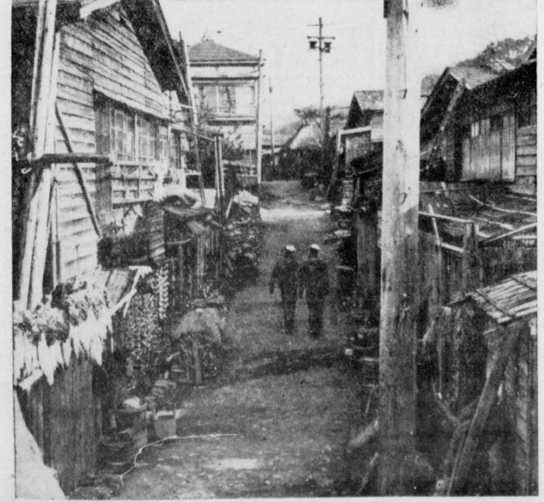
STREET SCENE —Two U. S. sailors walk down a tiny street in the little town of Asamuchi, near the northern Honshu port of Aomori. Vegetables drying along the fences are typical of Japan this winter, for the scarcity of rice makes conservation of other foodstuffs a "must".

WASHINGTON, Jan. 2. (AP)—Gen. Omar N. Bradley, veterans' administration, sought a last-minute conference with President Truman today to counter a recommendation by the Civil Service Commission that he veto a bill to create a separate veterans' administration medical corps.