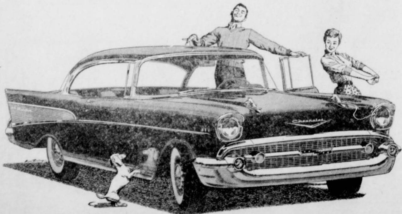
More beautifully built and shows it—the Bel Air Sport Coupe.

Chevrolet's more beautifully built and shows it. It brings you the extra solidity of Body by Fisher—fine construction and finishing touches that give you more to be proud of. Come in and let a sweet, smooth and sassy Chevy show you what we mean.