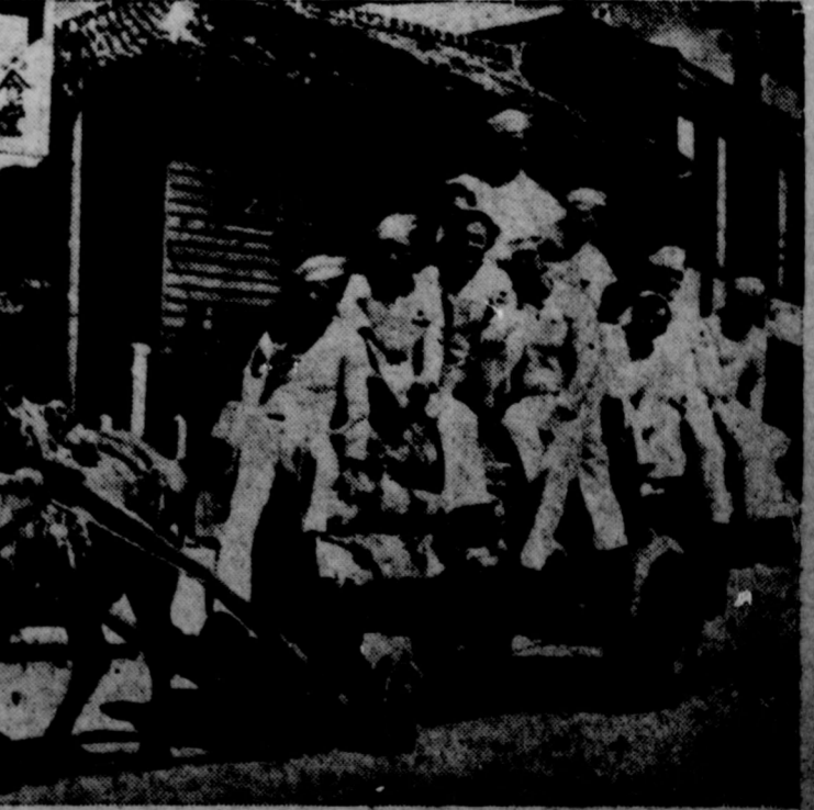
OKCART ODYSSEY—Enlisted men from the Navy cruisers USS Denver and USS Cleveland take on a native escort through streets of Valoonoura, Japan, shortly after American occupation of the Japanese port.

CHRISTMAS PARTY TONIGHT. All children of First Methodist Sunday school will meet at the church tonight at 7 o'clock for their Christmas party. Adults will meet at 7:30 o'clock.