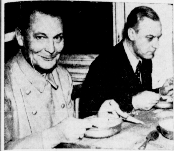
HERMANN PACKS IT AWAY —Smiling (perhaps it's that good American chow) Hermann Goering seems to be having a good time as he dines with a lugubrious Alfred Rosenberg at the Palace of Justice in Nuremberg where Nazis are being tried as war criminals. Quite a comedown in silverware, eh boys?