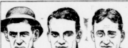
WALTER TRAVIS (1904) JESS SWEETSER (1920) BOBBY JONES (1930) THESE ARE THE ONLY OTHER AMERICANS EVER TO WIN THE BRITISH AMATEUR TITLE

LITTLE FIRST LEARNED TO PLAY GOLF IN TIENTSIN, CHINA, WHEN HE WAS 13.7