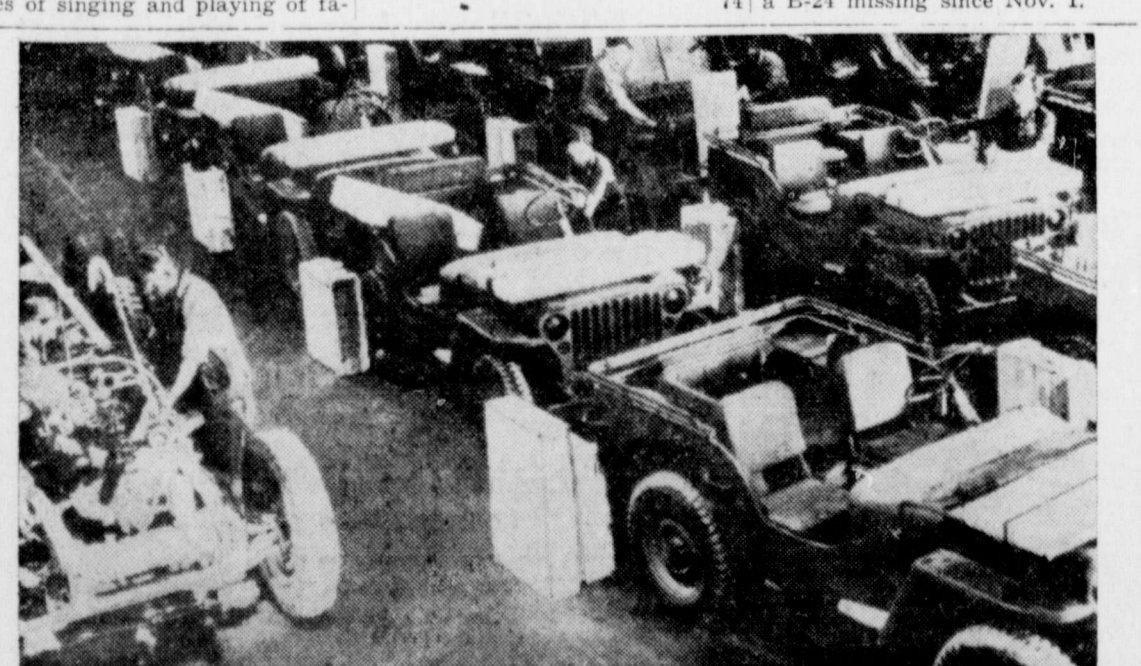
WANT TO BUY A JEEP? —Some of 10,000 new and used jeeps offered for sale to war veterans by RFC are checked in Columbus, O. Prices range from $598 to $782.