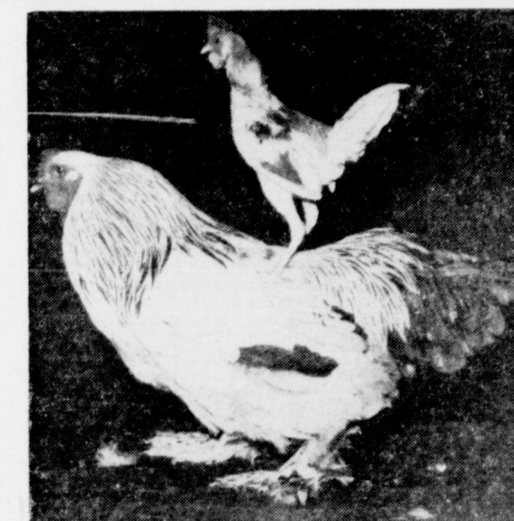
CHICKERY CHICK —A little 12-ounce Red Pyle modern game cock finds ample perch on the back of a 14-pound light Brahma at the annual Poultry Show in New York.

SUPPORTS US. BID. LONDON, Dec. 11. (AP)—Foreign Minister Jan Masaryk of Czechoslovakia proposed today that if the United Nations organization settles in the United States, a permanent branch be set up in Europe, and vice versa. He supported the United States' bid for permanent headquarters of the body.