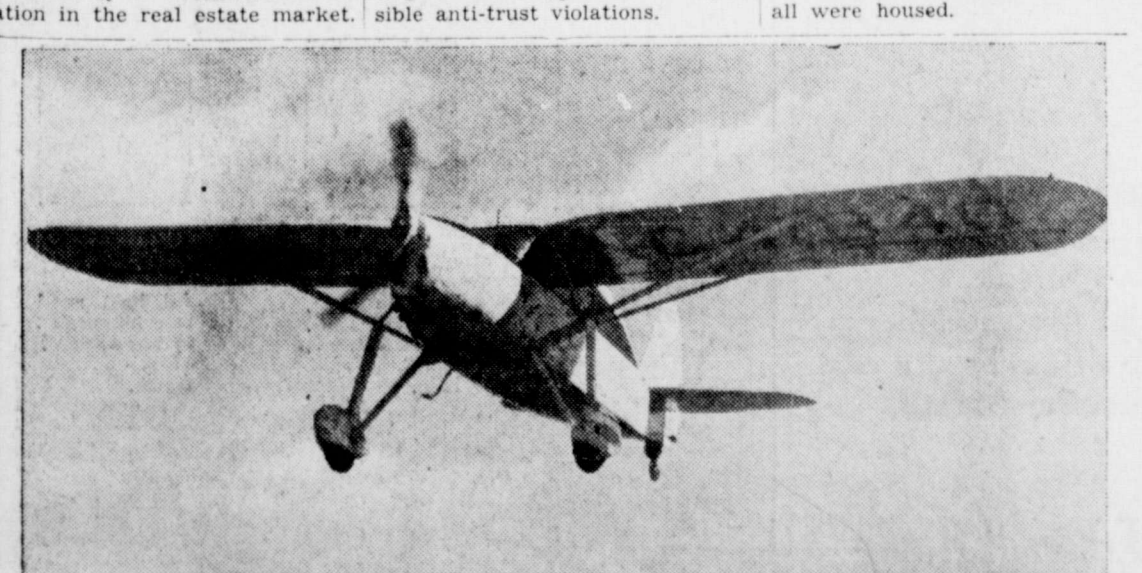
PERSONAL PLANE-New Fairchild F-24 personal plane is similar to a model used by the Army Air Forces. The civilian version is designed to appeal to sportsmen and business executives. It seats four persons, has good luggage space and a cruising speed of 118 miles per hour. It can attain a top speed of 133 miles per hour.