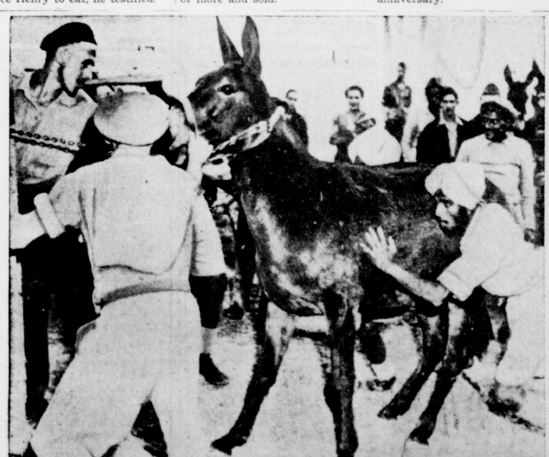
"GO 'LONG MULE!-"-A British mule shipped from Italy to Yugoslavia by UNRRA proves typically stubborn as workers strive to get him into a freight car. About 4400 U. S. and British Army surplus mulas have been appropriated for draft and transport work.

WASHINGTON, Dec. 7. - Mrs. Charles Evans Hughes, wife of the las office complaining that he had Walker stated today that with- retired chief justice, died last night