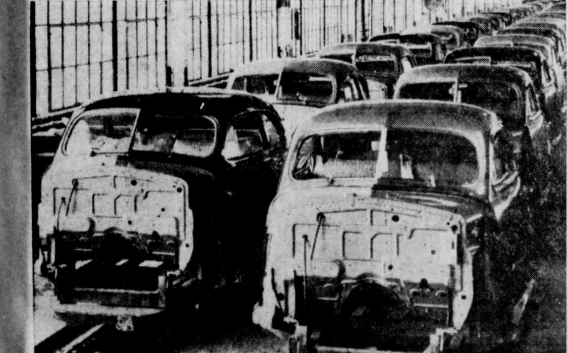
IDLE LINEUP —Bodies by Fisher stand idly in the General Motors plant in Detroit awaiting settlement of the UAW-CIO strike so that they can be sent to the Oldsmobile plant at Lansing, Mich., for completion.

"Since the tax that oil pays is based on the price, our state lost a tremendous amount of tax revenue. If the price had been $1.96, the public schools in Texas would have had $58,000,000 more with which to operate during the war. This would have made it possible to have raised the salaries of teachers, provide better equipment and lengthen the terms of rural schools, thereby giving boys and girls a better chance in life. And this heavy loss of tax revenue is still going on because of the inequitable price of oil."