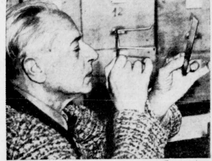
LOVE'S LABOR LOST —After doing a bang-up job of destroying his files, Heinrich Hoffman, Hitler's official photographer, has won the unenviable task of unscrambling and identifying 75,000 photographic planes for American investigating officers.

No wreckage was found in the morning. Rescue operations were underway there and a vast search covered all of Florida and nearby waters for the smaller planes.