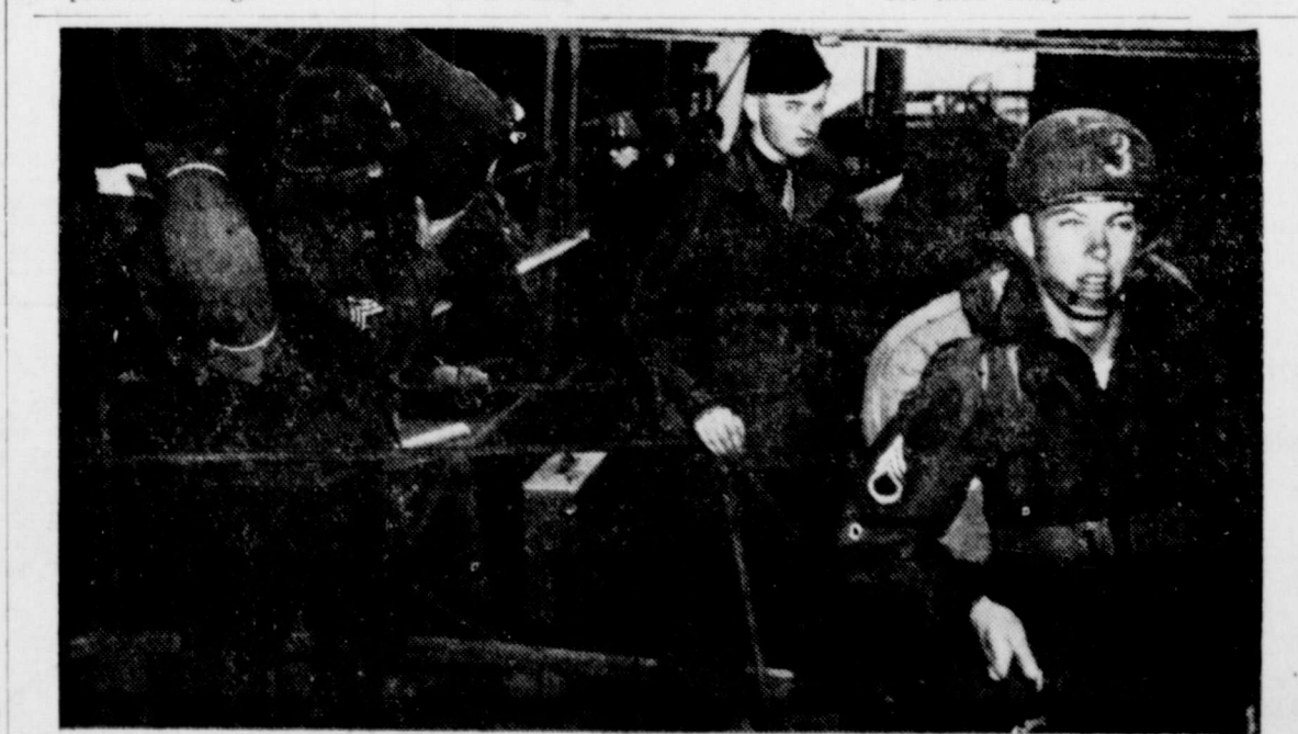
NOT SAILING—Dispute between Maritime Unions and War Shipping Administration over crew's living quarters aboard SS Marine Adder tied up vessel and caused 900 Army officers and men to debark in San Francisco instead of sailing for occupation duty in Pacific.

WASHINGTON, Nov. 16. — Three men stopped a southbound freight train about 15 miles south of here early today, broke into a box car and stole about 15 cases of whiskey.