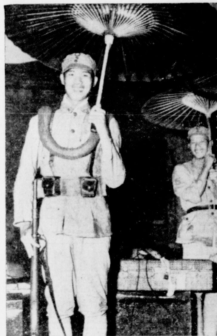
UMBRELLA MAN—With Chinese "G.I." umbrellas in one hand and gun in the other, a grinning sentry of the 70th Nationalist Army stands guard at one of the docks at Kiuin, Formosa. The Army was landed by units of U.S. Seventh Fleet, first major amphibious operation of American and Chinese forces.

Price Administrator Chester Bowles had said ceilings for some makes of cars would be disclosed yesterday. He cancelled that plan to take a good look at dealers' new arguments that they can't absorb any price increases granted to manufacturers. It was the second postponement in a week.