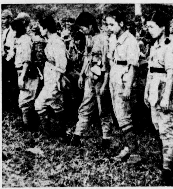
JAP NURSES SURRENDER—Wearing regular Army uniforms, these nurses were among the 10,000 Japs who surrendered to American Division on Cebu, P.I. Nurses had been in field for 19 months and had received no mail or word from home.