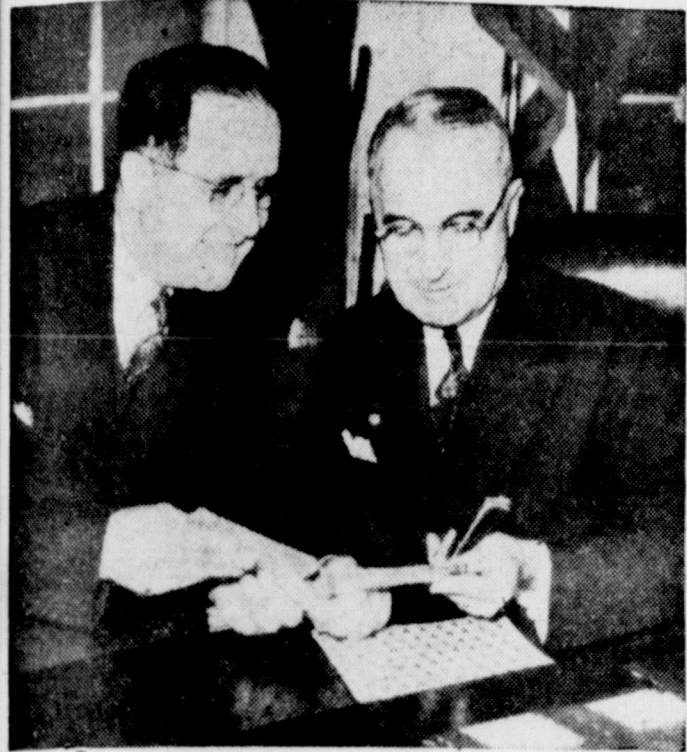
PRESIDENT TRUMAN opens 39th annual Christmas Seals Drive of National Tuberculosis Association and affiliated groups by purchasing first sheet of seals from Secretary of Agriculture Clinton F. Anderson. Public sale begins Nov. 19.