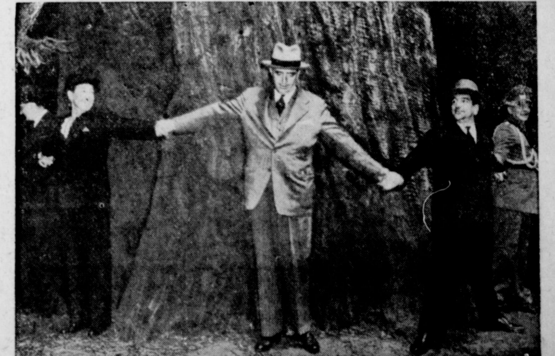
LARGEST LIVING THING seen by President Juan Rios of Chile on his tour of the United States was this huge California Redwood tree. President Rios, center, and eleven members of his party extend arms and clasp hands as they measure the girth of giant tree in Muir Woods, Calif.

"The order already has been given. I'm sorry but war is war."