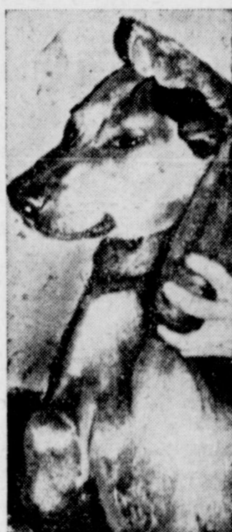
PROBLEM PUP —Pepe, wine guzzling mongrel pup, puts paw to head as though suffering from hangover. Naughty dog is held in Los Angeles animal shelter where he is being scientifically treated for chronic alcoholism.