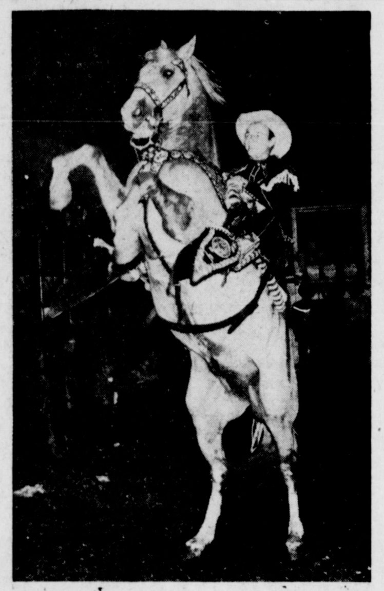
RIDING HIGH-All decked out in shining trappings, cowboy Roy Rogers rears his famous horse "Trigger" at rodeo in New York. Sailors in port for Navy Day activities formed greater part of audience watching bronco busters go through chores.

Cisco Loboes and Brownwood Brownwood tomorrow night.