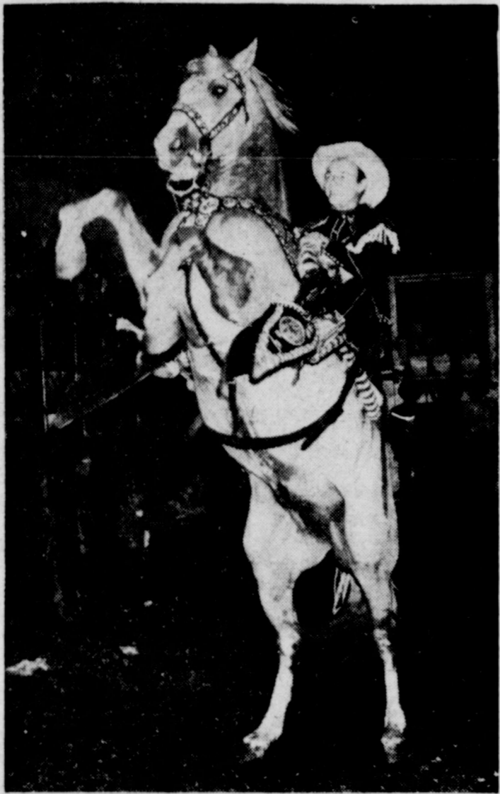
RIDING HIGH —All decked out in shining trappings, cowboy Roy Rogers rears his famous horse "Trigger" at rodeo in New York. Sailors in port for Navy Day activities formed greater part of audience watching bronco busters go through chores.