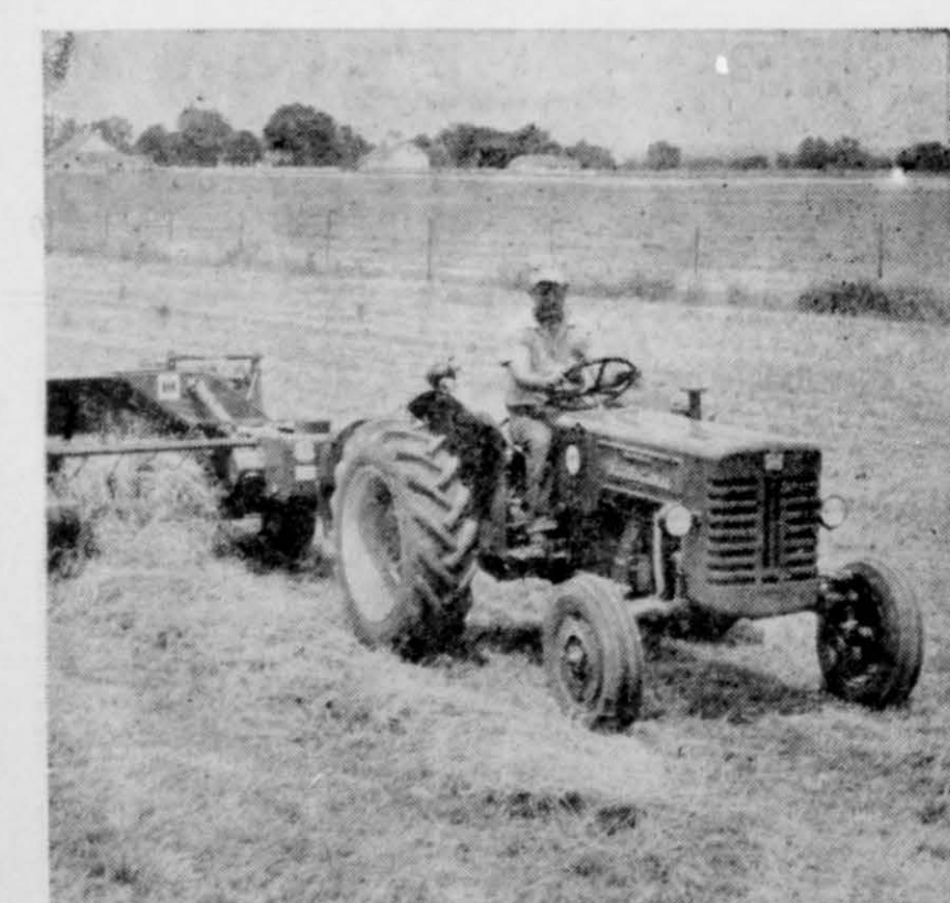
Champlin HI-V-I Motor Oil