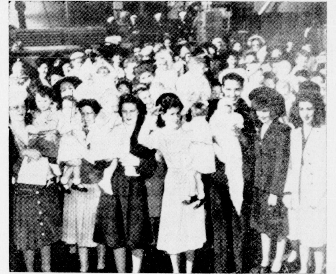
AUSSIE WIVES ARRIVE —Some of 550 Australian brides and 201 children of American servicemen who arrived aboard U. S. liner Lurline wave from San Francisco dock. Largest group of war brides to reach the United States, girls are en route to their husbands' homes.