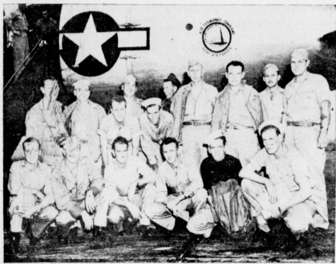
FIFTEEN SURVIVORS of the ill-fated cruiser, USS Houston, and one sailor captured when Corregidor fell are shown as they arrive in Washington, via A. T. C. plane. Men wear new emergency clothing issued by the Army to replace unkempt prisoner of war garments.