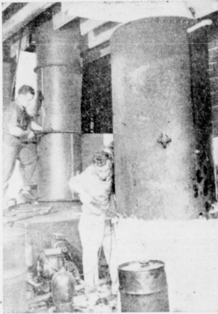
DISMANTLING —Men employed by Treasury Department's alcohol tax unit dismantle 675-gallon still found in garage in Chicago's North Side. Still was not operating when raided.