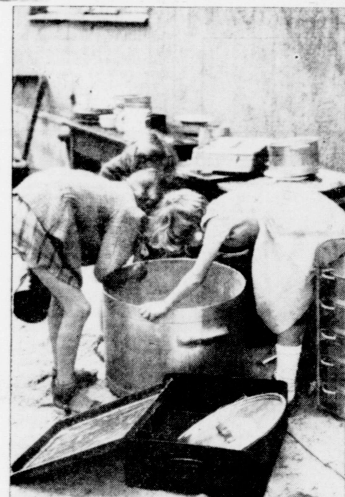
VICTIMS OF WAR—Hungry children search for food in scrap bins outside American mess hall in Germany. Youngsters take what they salvage home to parents to supplement meager food supply.