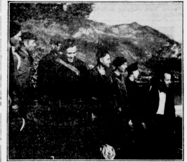
These French prisoners of war are all smiles as they look at their homeland during a stopover on the train trip from Germany to France. Some of them haven't seen France in five years, but this year they will be able to help their country celebrate Bastille Day (July 14, France's Fourth of July). Although the celebration, because of food and transport shortages, will be somewhat sober, it will be the first Bastille Day without Germans since 1939.