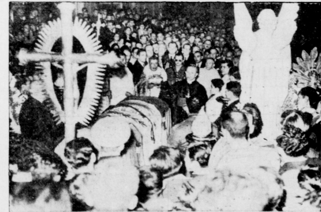
LAST RITES—Papal Nuncio Monsignor Fernando Cento blesses-casket of the late Oscar R. Benvides, former President of Peru. Ceremonies were held at Basilica de la Merced in Lima.