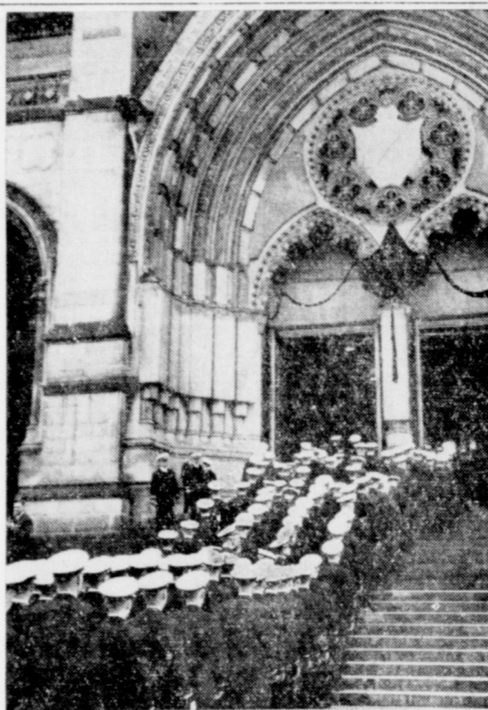
ENSIGNS from the U. S. Naval Reserve Midshipmen's School at Columbia University march into the Cathedral of St. John the Divine in New York. Edifice will be setting for graduation and commissioning ceremonies.

If you think for a minute that all laxatives are more or less alike you certainly have a real SURPRISE awaiting you when you take Kruschen Salts. When you feel bloated, headachy and meanly sluggish—because you need a good cleaning out—what you then should try is KRUSCHEN SALTS. When you want relief you want it PROMPTLY. Kruschen, a true saline laxative, answers today's need TODAY. Caution—use only as directed. Regulate the dose to suit yourself. Remember the name and get KRUSCHEN SALTS today at any good drug store.