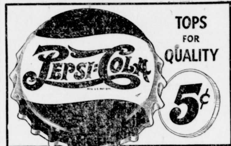
Pepsi-Cola Company, Long Island City, N. Y. PEPSI-COLA BOTTLING CO., Brownwood, Texas