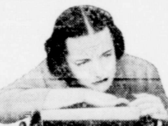
Here's a SENSIBLE way to relieve distress of