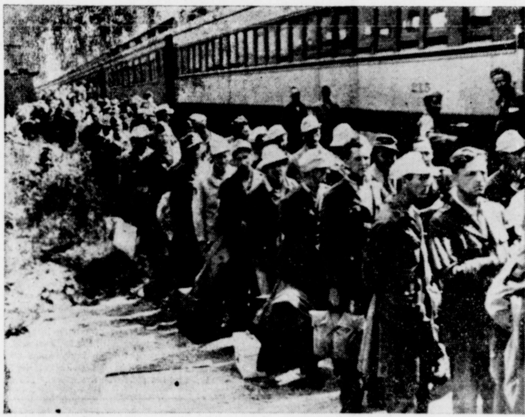
POW HARVESTERS —Contingent of Nazi captives from prisoner of war base at Fort Sheridan, Ill., are shown with baggage on arrival at Sturgeon Bay, Wis. Men were transported to help harvest Door County's nine million-pound cherry crop. Government will purchase entire harvest.