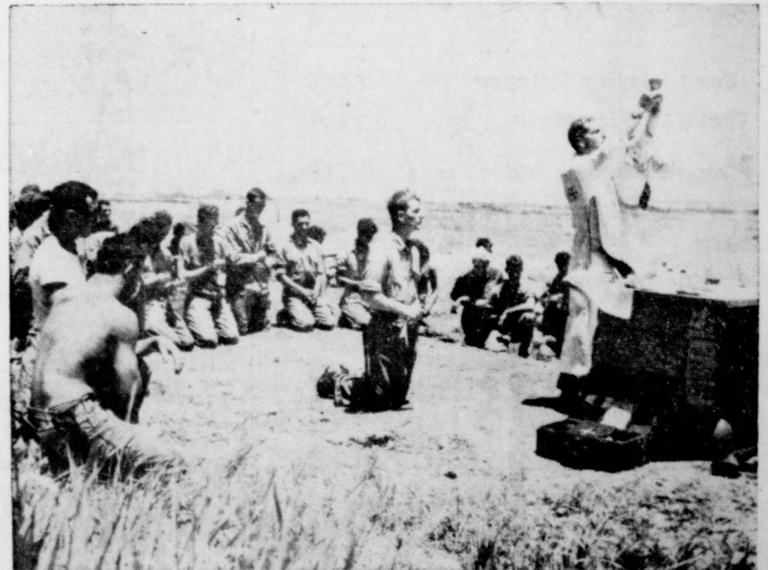
THE SOLDIERS' THANKS —Battle weary Marines of the 6th Division kneel in Okinawa dust to give thanks and to pray for comrades who sacrificed their lives. Ceremony followed securing of southern end of vital island. Ration boxes support Chaplain's altar.

MANILA, July 19. — The U. S. 32nd "Red Arrow" Division marks its 600th day in combat Friday, July 20. This division lays claim to the highest total combat time amassed by any American division in any war. Men of its ranks are now in their fourth year overseas.