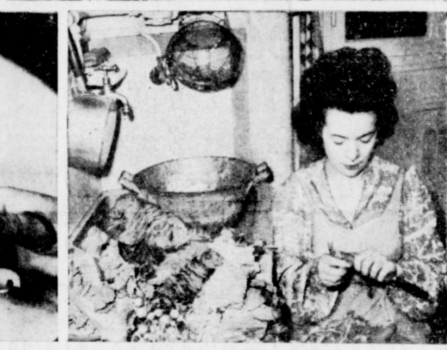
THE PARISENE'S HEADACHE —Queues are long, supplies short, prices high, and everything is rationed on Paris food marts. Madame counts her money (upper left) as she starts unpleasant task of shopping for the family dinner. She selects head of cabbage (upper right), some radishes, carrots, and