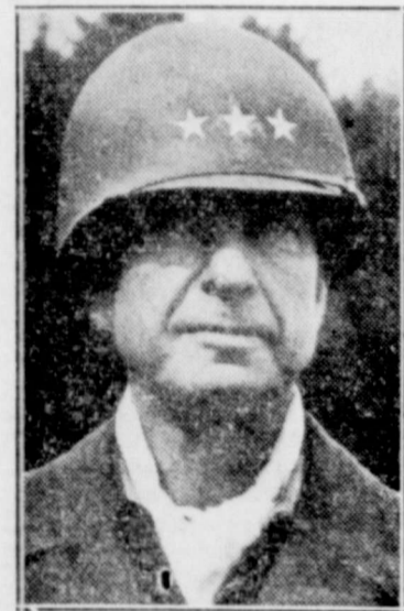
GOERING'S BATON —General Alexander Patch, returning from overseas, brought along the much ornamented swagger stick of Reichsmarshal Herman Goering. It will be placed in the U. S. Military Museum. General Patch received an ovation on his return to Staunton, Virginia.