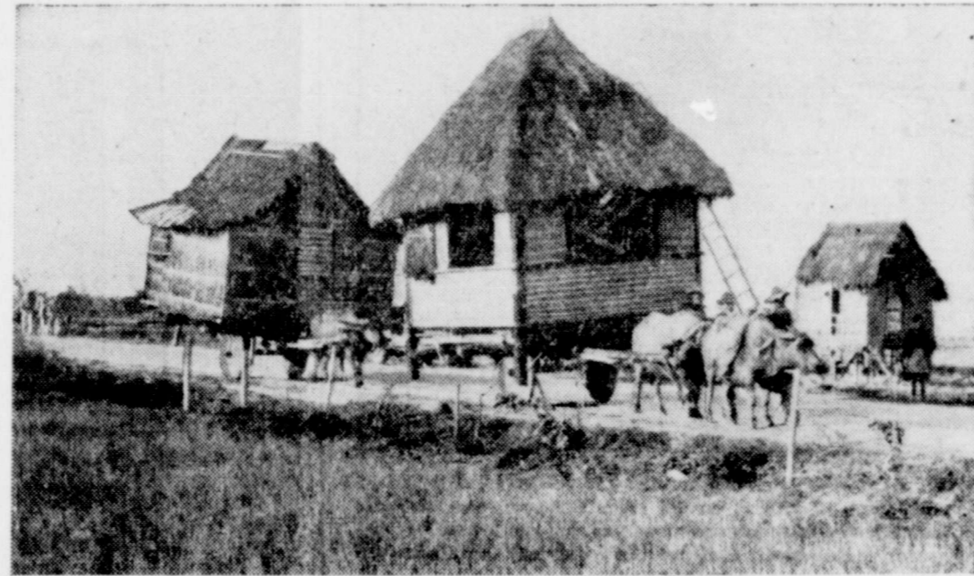
MOVING DAY—When natives decide to change location in the Philippines, not only does furniture go along, but whole house as well. Here water buffaloes plod slowly down country road with thatched huts mounted on crude two-wheeled carts.

Contributing generously to ease of driving by totally eliminating the clutch pedal and affording fully automatic shifting through four forward speeds, is the new General Motors Hydra-Matic Drive—a brilliant feature of the new Oldsmobile for 1946. This view illustrates the driver's compartment, with Hydra-Matic Drive. The mechanisms have been given the most punishing tests to which any automotive unit can be subjected—the tests of war. They have been employed in thousands of tanks, armored cars, and other military vehicles with complete success and have won the admiration of the fighting men who use them. Hydra-Matic Drive heads the list of many modern developments incorporated in the new Oldsmobiles.