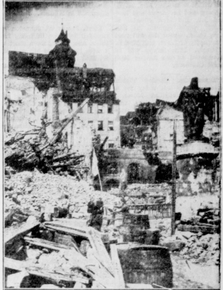
ONCE A NAZI SHRINE—View of a public square in the ancient German city of Nurnberg after its capture by American troops. At the right may be seen the statue of Albrecht Durer, famous mediaeval painter and engraver, which escaped Allied air attacks. Nurnberg in recent years was the center of important munitions industries which were destroyed by Allied bombing operations. It is estimated that more than 22,000 tons of explosives were dropped on the city's airfields, railroads and industrial targets.

S. forces in Canada. He has been employed by the Humble Oil company for the past fifteen years, most of his time being spent in Mississippi. The bridal couple came to Cisco following the wedding and visited over the weekend in the home of his mother. They left Monday for Pampa, Tex., where he has been transferred by his company.