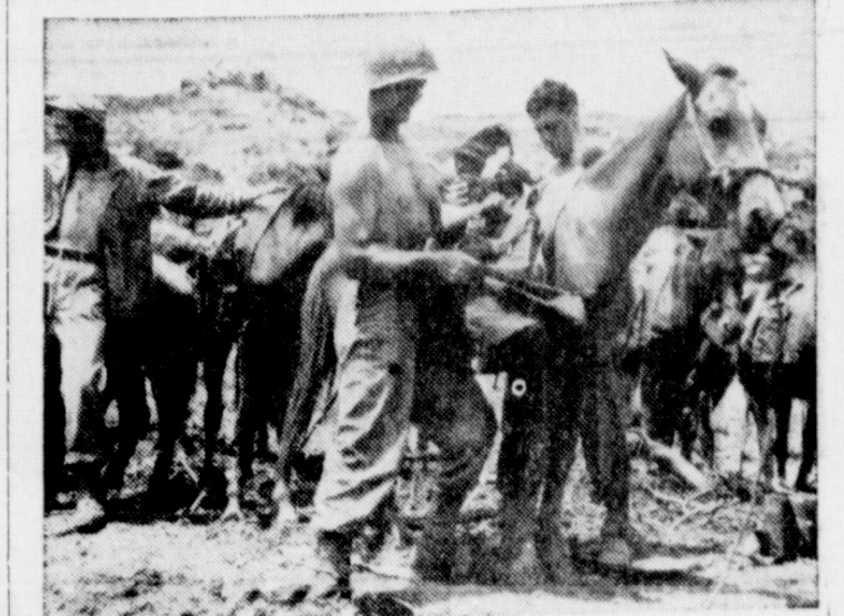
When Okinawa's heavy mud prevented use of motorized vehicles to carry ammunition and supplies to Shuri Castle, resourceful Marines corralled a number of horses to solve the transportation problem. Leathernecks are shown loading 48-pound ammunition cases prior to starting off for the former Jap key defense position.