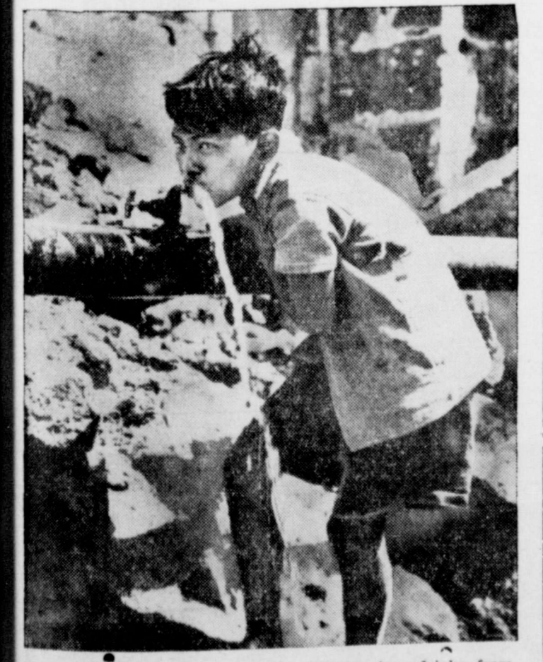
LITTLE THINGS THAT COUNT—Filipino boy drinks from emergency tap constructed by Yanks to alleviate contaminated water problem in the Philippines. Families come to oasis to fill buckets with water for drinking, cooking and laundering.