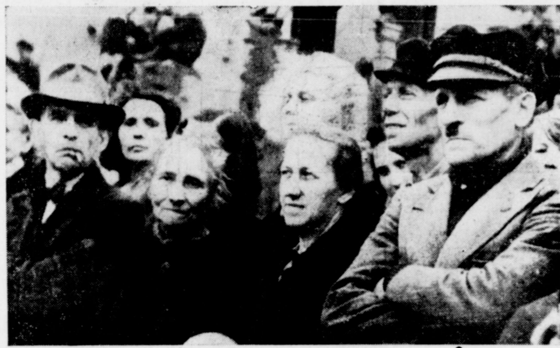
NOT CORDIAL—Expressions on faces of these citizens of Berlin are for the most part grim. They are watching British occupation troops led by 11th Hussars—veterans of El Alamein—move into German capital to take over British zone. Man at right emulates der fuhrer's mustache.