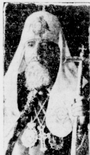
TO VISIT U. S.—Second patriarch of Russian Orthodox Church elected since 1917, Patriarch Alexius, above, will visit U. S. shortly.