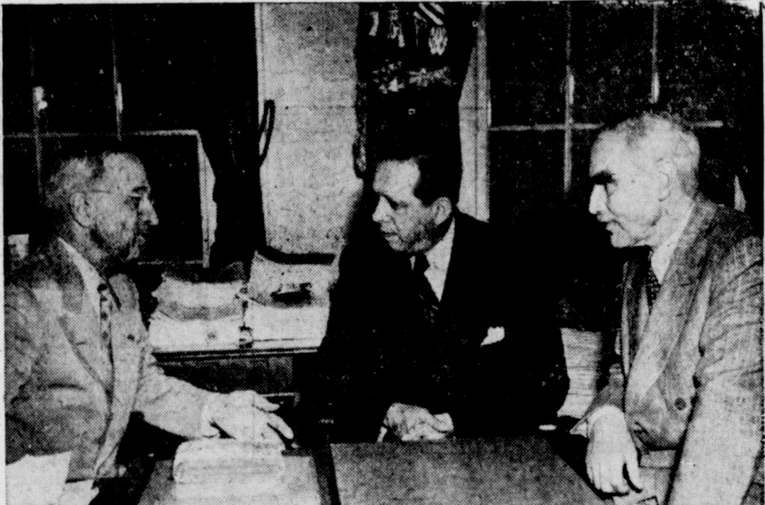
LOOKING FOR SOLUTION—President Truman and Acting Secretary of State Joseph Grew, right, confer with Mexican Foreign Minister Ezequiel Padilla, center, on the "Chamizal Question." It involves strip of land in El Paso, Texas, which is claimed by Mexico.