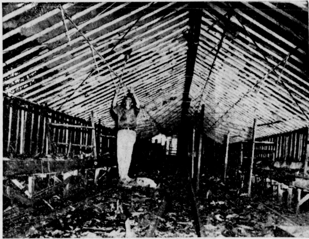
HAIL, HAIL, BUT GANG'S NOT HERE—This scene of broken glass and rubble testifies to the force of hail storm which whipped through Ottawa, Kansas. Pictured here is the Osburn greenhouse, which lost almost all its glass.

FT. WORTH, July 10.—Ticking of autos found without 1945 federal tax stamps was started this morning by 24 deputies from the internal revenue bureau. In canvass of about 50 percent of the city yesterday, some 4,000 autos were found to be minus the stamp on windshield.