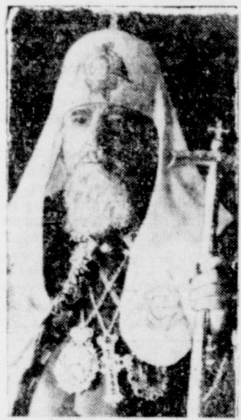
TO VISIT U. S.—Second patriarch of Russian Orthodox Church elected since 1917, Patriarch Alexius, above, will visit U. S. shortly.