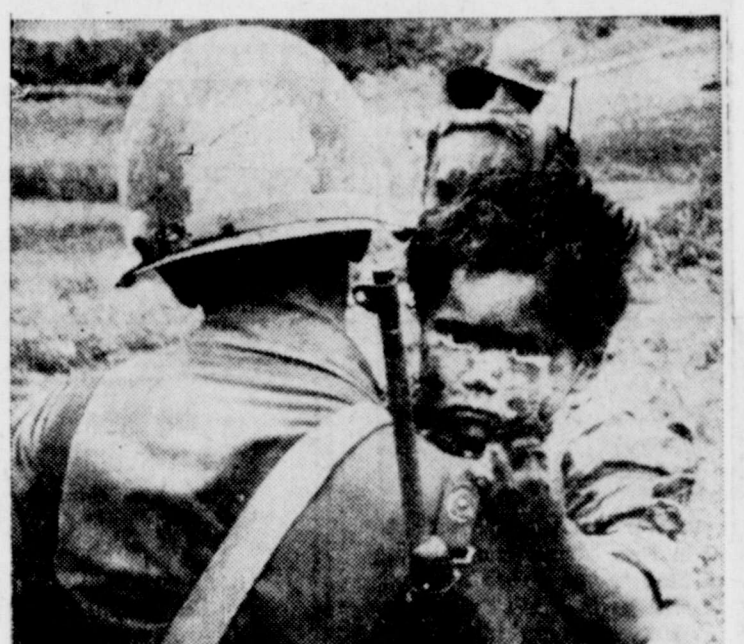
YANKS ARE KIND —Plaintive looking little girl with mud-spattered face is carried by Leatherneck to safety zone on Okinawa. She was found hiding in cave with frightened parents who believed propoganda of Japanese.