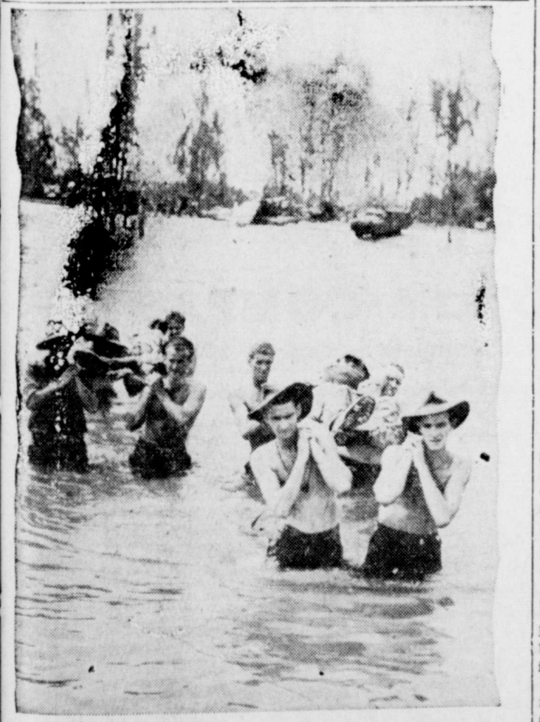
EVACUATING THE WOUNDED —Undaunted when Higgins boats are unable to run up on beach, Aussie soldiers carry wounded comrades through water on litters to meet craft. Boats later carried casualties to the hospital ship in harbor.