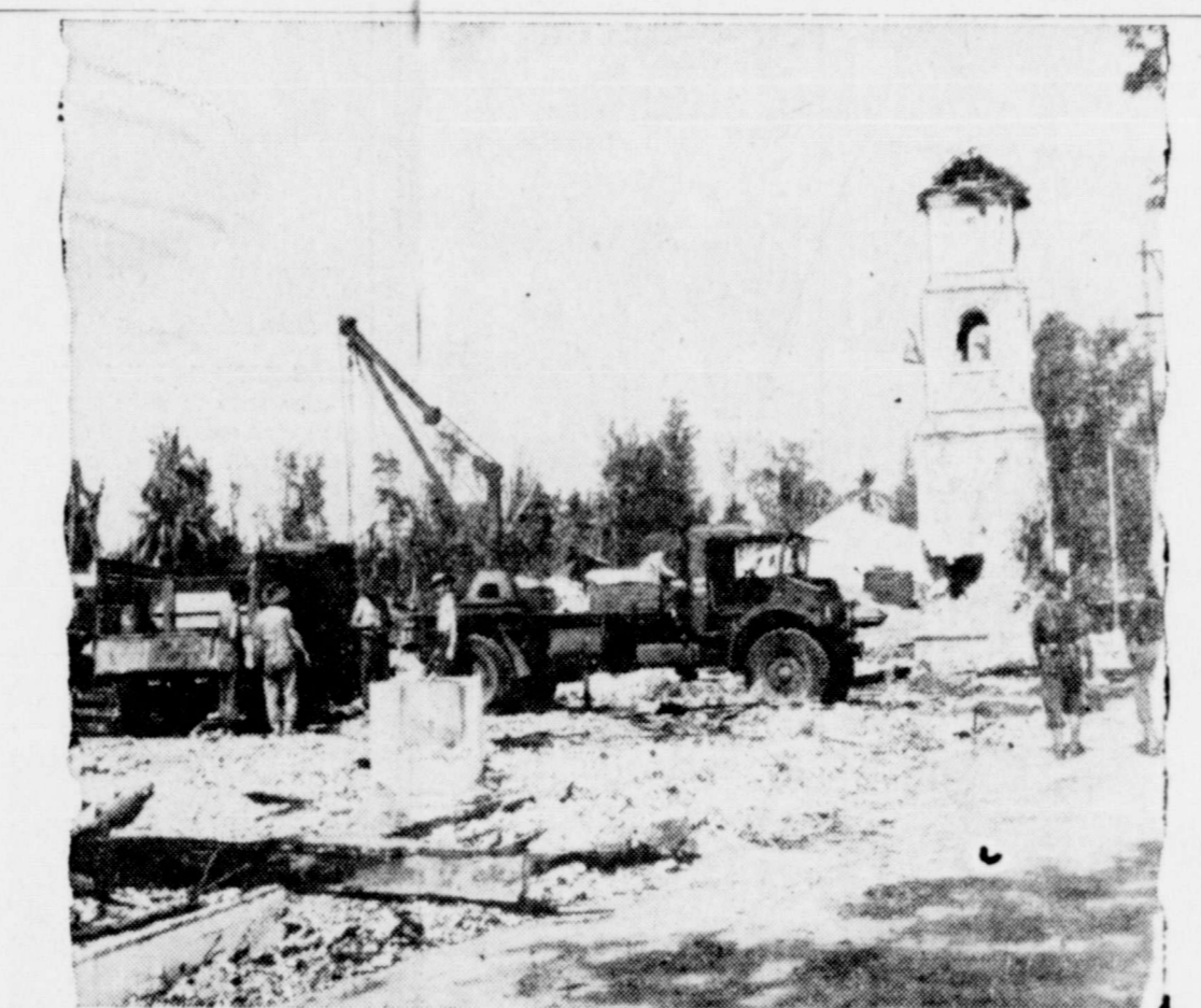
IMMEDIATE RECONSTRUCTION —Even before fighting on island is over, Aussie engineers build Victoria, main settlement on Labuan, Borneo. Town was practically destroyed by U. Navy gunfire which preceded landings. Here Bulldozers clear rubble from streets