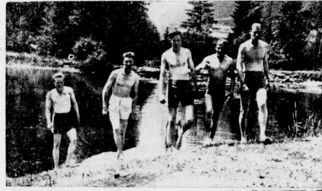
LIKE THE OLD SWIMMING HOLE, Yanks occupying the Austrian Tyrol find this lake in the Alps quite refreshing. Fir trees fringe quiet waters surrounded by snow-capped mountains. Men emerging after swim are members of the 44th division of U. S. 7th Army at Leodach, Austria.