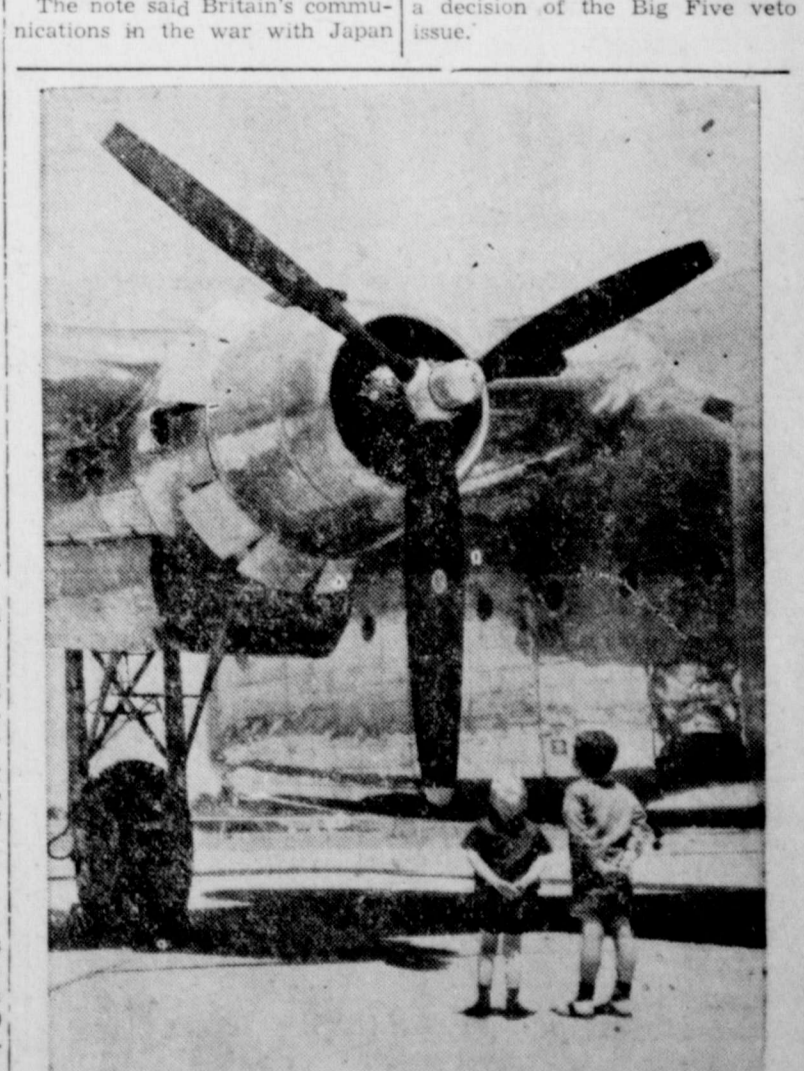
WITH PRIDE these youngsters look on giant C-82 Packet which their daddies helped build at war plant at Hagerstown, Md. Fuselage carries nine tons of military supplies.