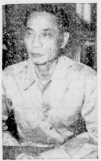
RUMORS indicate that Brig. Gen. Manuel Roxas, Filipino patriot leader, will be Sergio Osmena's chief rival for Presidency if Philippines are granted independence and elections are held. He cannot engage in politics while in uniform.