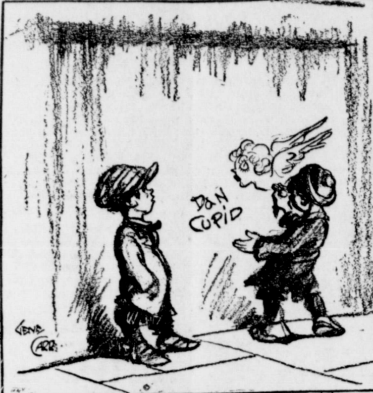
"He Means Love, Does He? Why th' Wings?" "How's He Goin' T'beat It When He Gets Fed Up? Foolish!"