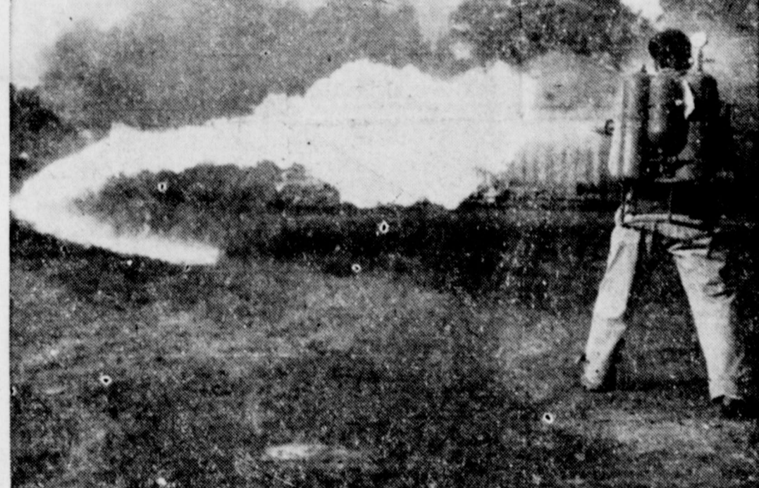
PORTABLE FLAME THROWER M2-2 designed especially to combat Japs, is demonstrated at Little Falls, N. J. Solid sheet of flame shoots from new weapon during practice firing of jellied gasoline. Range of firing has been increased with new fuel from 30 yards to more than 60 yards. Gun can be fired either in short bursts or in one continuous burst on Japanese positions.

WASHINGTON, May 31.—U. S. combat casualties in this war passed 1,000,000 today.