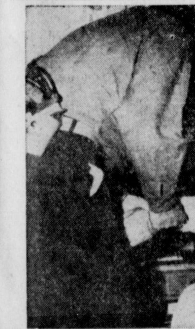
NAZI LABOR BOSS Dr. Robert Ley didn't have time to dress before capture at mountain hideaway near Berchtesgaden, Germany. Here American soldiers of 101st Airborne Division search pajama-clad 55-year-old German. He looks indignant over humiliating position.