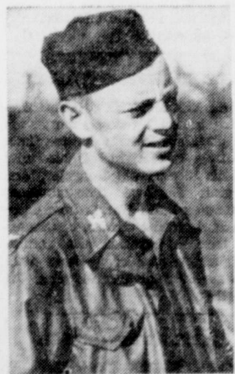
REPORTED missing in action October 1944, Col. Hubert Zemke was liberated by Russians from Barth prison camp recently. The U. S. 8th Air Force ace was put in command of the camp.