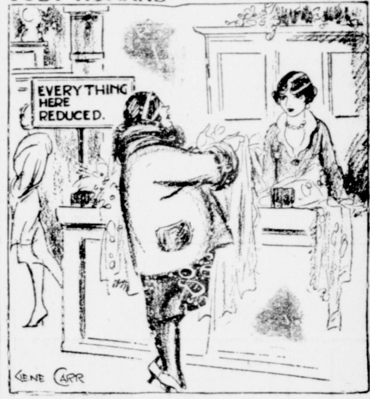
EVERYTHING HERE REDUCED.