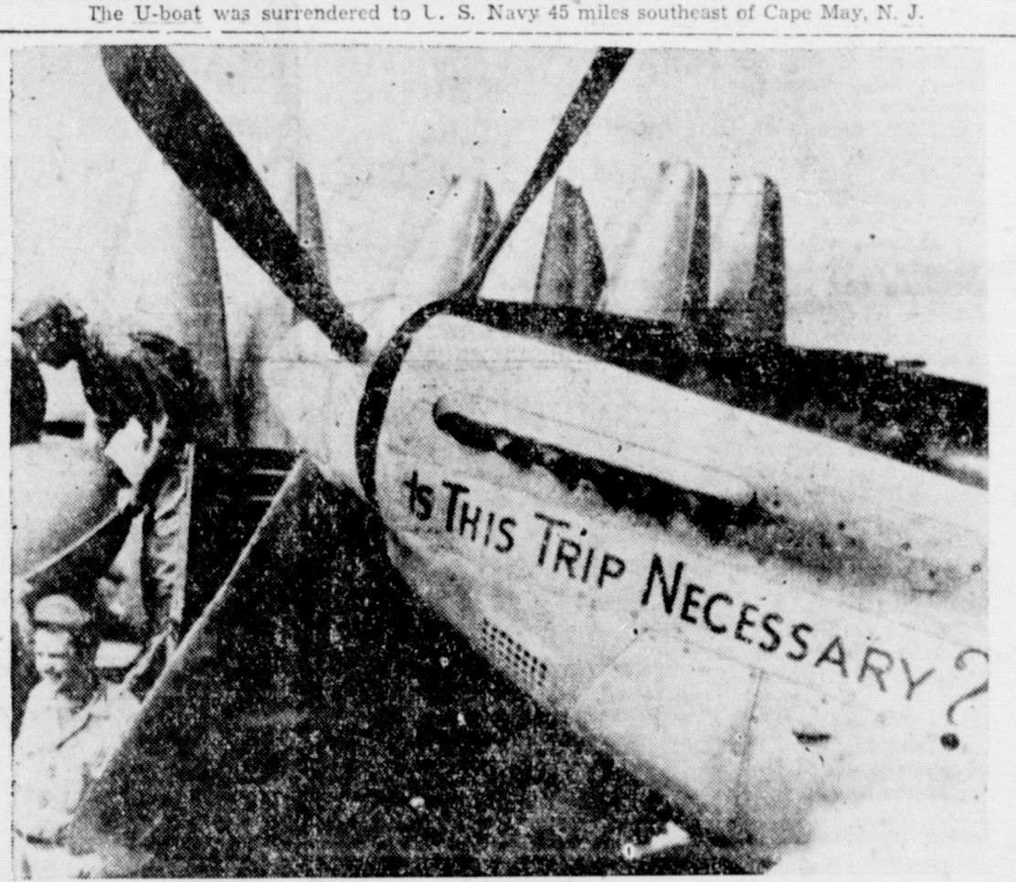
TANK HUMOR-The name of this Fighter Command Mustang reveals that American fighting nen have not lost sense of humor, "Is This Trip Necessary?" makes daily excursions over Tokyc erd other Jap targets. Here ground crews unload auxiliary wing tanks.