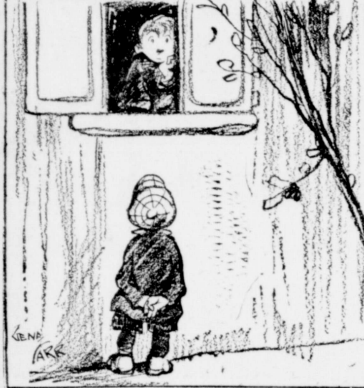
"Wot's on Y'mind, Mel?" "Oh, Just Spring!"