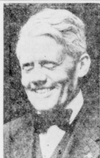
NAMED by King Christian X as Premier of Denmark, John Christmas Moeller smiles approval of the joyous ovation given by countrymen on arrival home.