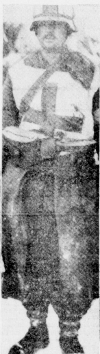
DOUBLE CROSS—With body and helmet covered with Red Cross, Nazi medic looks humble after capture by 1st Army troops in Belgium. He carried his medical supplies in two U. S. Army field glass cases strapped around his waist.

About 35 or 40 Cisco Odd Fellows and Rebekahs attended the county convention of Odd Fel-