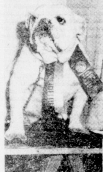
PROUD PUP—With nose turned up in proud disdain, English bulldog, Zorro Torro la Zorro seems to be well aware that he is no ordinary hound. On his neck are ribbons of first prize and best-of-breed awarded at San Francisco dog show.

We are told not to let the sun go down upon our wrath, but how in the world can we keep the sun from going down.