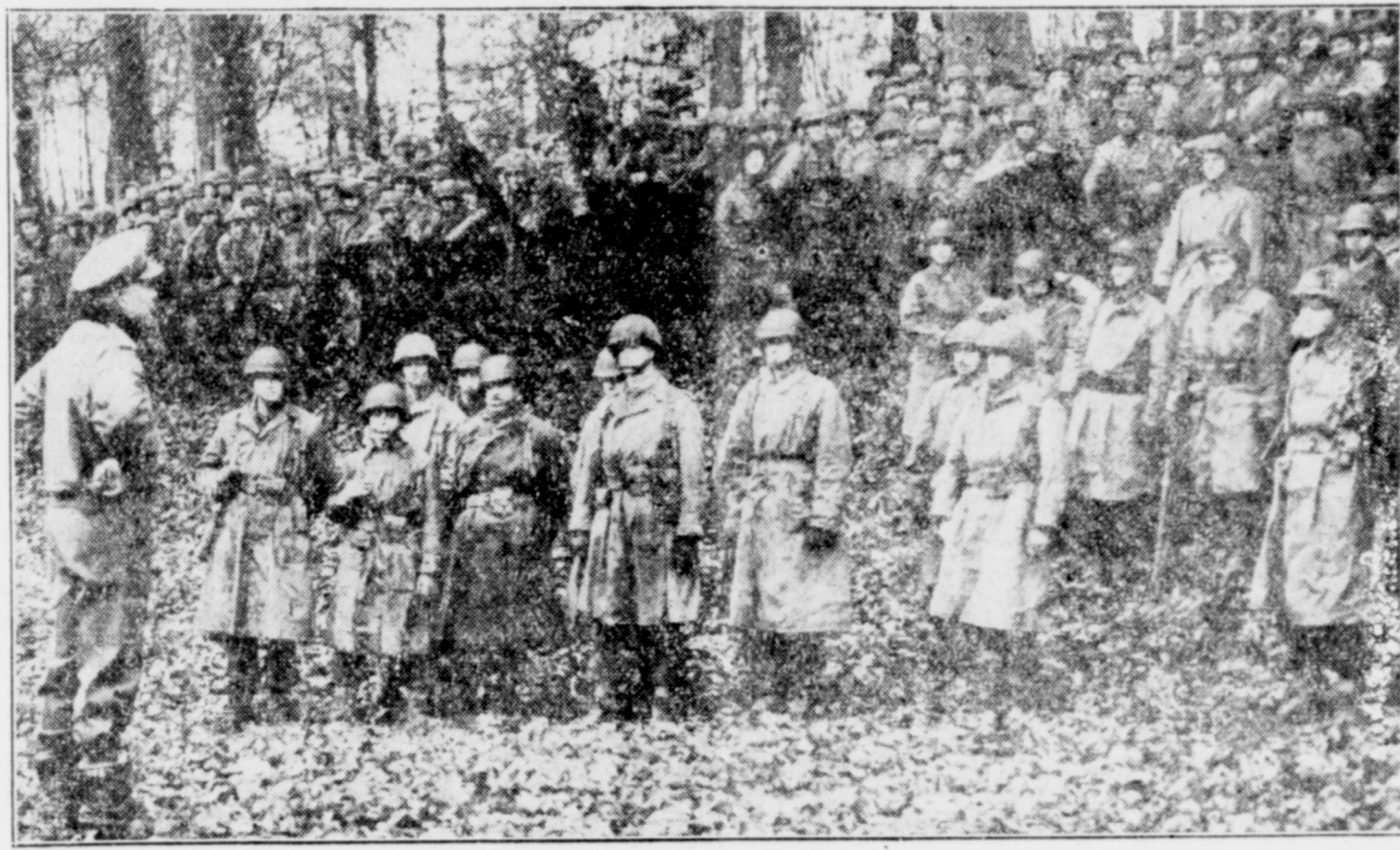
GENERAL DWIGHT D. EISENHOWER, Supreme Commander, talks to men of the 29th Infantry Division on the European front. The General praised these men.