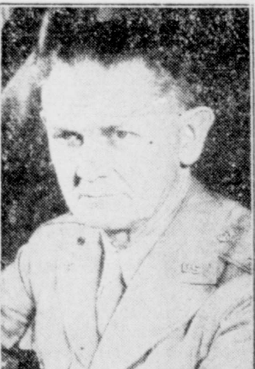
CHIEF OF CHAPLAINS—For the first time in the history of the United States Army the Chaplain's Corps is headed by a major general.