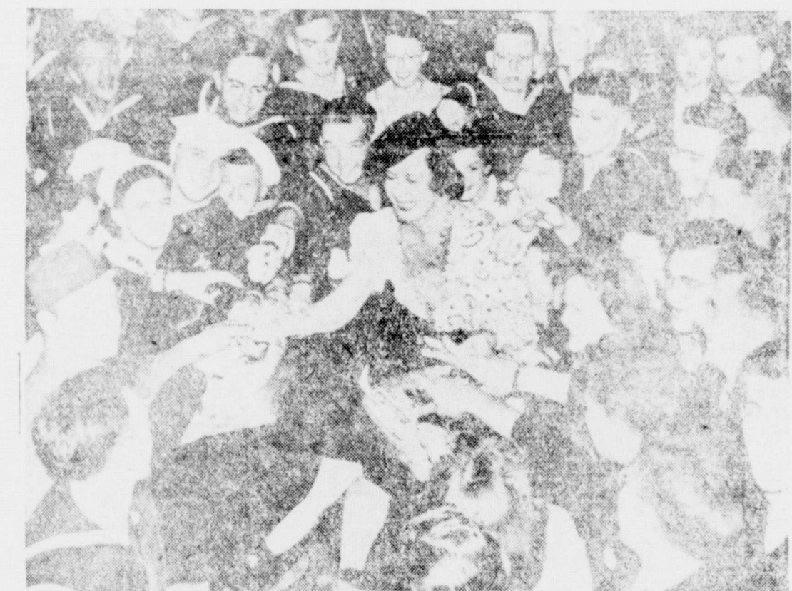
NO SHORTAGE HERE—Gladys Swarthout, popular opera star, causes general rejoicing as she helps relieve cigaret shortage by dispensing free smokes to GIs in Chicago, where she was portraying the fiery Latin cigaret girl in "Carmen."