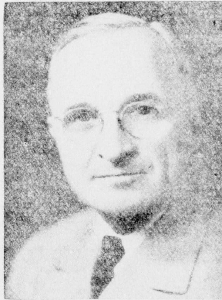
HARRY S. TRUMAN

NEW YORK, Nov. 8.—President Roosevelt's fourth term election was conceded today by Gov. Thomas E. Dewey, the Republican candidate, and a Roosevelt tide of votes apparently has substantially increased the Democratic congressional strength, assuring that party control of the House of Representatives. Democratic senate control was not in jeopardy in Tuesday's elections.