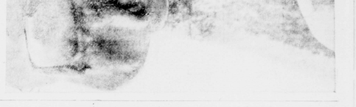
VICTIMS OF JAP TIME—British soldiers who helped invading Allies in taking Laika, fought with the Japanese, were taken prisoner and held in a camp near the Japanese front.