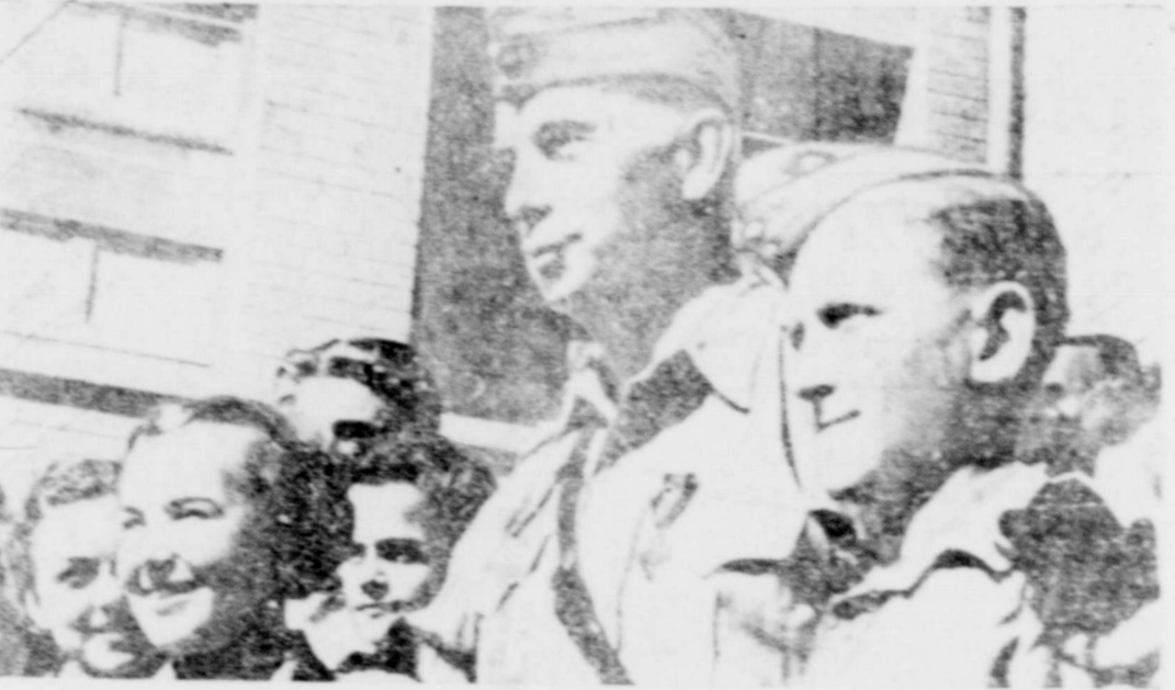
WELCOME FOR THE GENERAL—Released by the Soviet Union after Stalin-Sikorski agreement these Polish youngsters welcome their country's commander-in-chief, General Sosnkowski, who visits them during a tour of Middle East Youth camps for Polish war orphans.