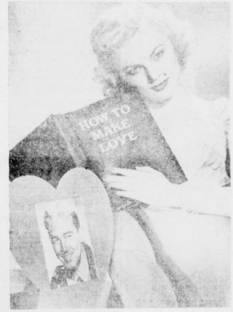
COMES VALENTINE'S DAY —Studying up on a most intriguing subject for Valentine's Day, June Haver, Hollywood starlet, is centering her attention on John Payne, Army Air Corps cadet, who shares the spotlight with her in new picture, "Home in Indiana."

Cisco Lumber & Supply "We're Home Folks"