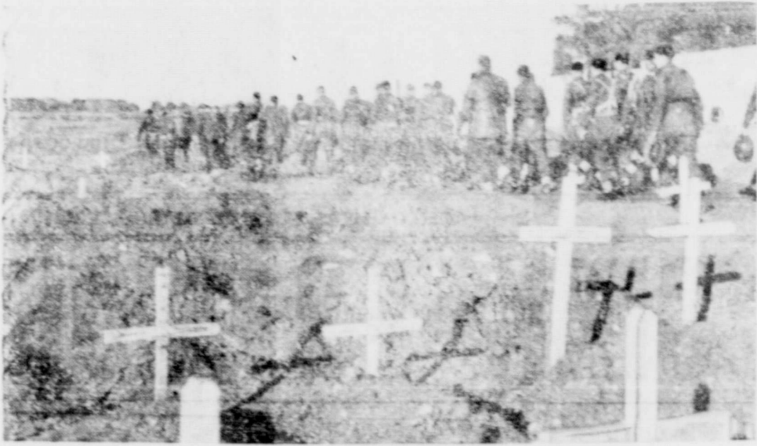
SORROWFUL PROCESSION—Fresh white crosses mark graves along road procession of Tommie travels, with beads bared, to bury the body of a comrade who died in battle for Anzio.