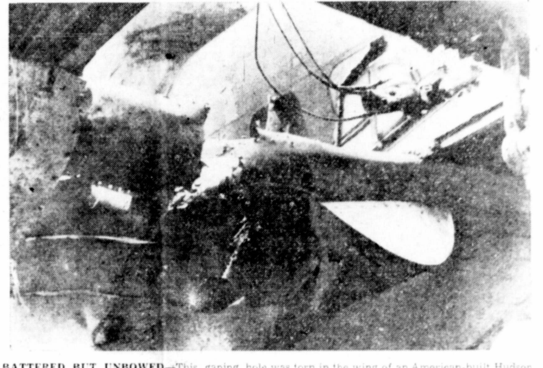
BATTERED BUT UNBOWED—This gaping hole was torn in the wing of an American-built Hudson bomber serving with the R. A. F. but heroic crew brought craft safely to British airport after participating in attack on Nazi convoy creeping along Dutch coast.

OPPOSE PRO ELECTION. FT. WORTH, Oct. 9.—The Fort Worth Trades Assembly, representing 11,000 men and women, today was on record against holding a prohibition election in Tarrant county at this time.