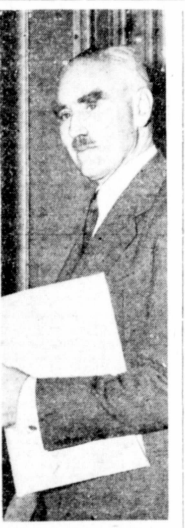
GREW REPORTS—Our former ambassador to Japan, Joseph C. Grew, enters executive session of Senate Foreign Relations Committee in Capitol. It is presumed he told of his last days in Nippon.

MERCILESS NAZIS. LONDON, Oct. 9.—German SS troop reinforcements are pouring into Norway and special courts martial are being organized at Oslo, Trondheim, Berge and other key cities for a Gestapo blood bath in which nearly 50 Norwegian patriots already have been sacrificed, special reports indicated today.